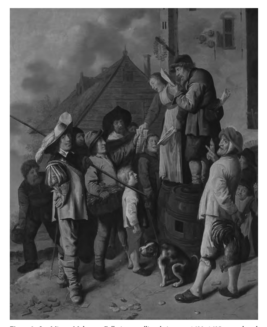
Figure 3. Jan Miense Molenaer, Folk singers selling their songs , 1630–1635, reproduced with permission from the RKD—Netherlands Institute for Art History.

operating the presses to raise charity after the floods and fires that periodically ravaged local communities. ^{70}