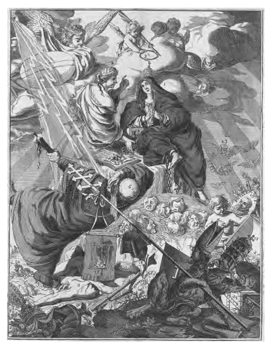
Figure 8. Pieter van den Berge (attributed to), The bloodthirst of the Jesuits, revealed in the oppression of the Polish Church , 1724–1726, reproduced with permission from the Rijksmuseum, Amsterdam.

an army of 60,000 Tartars, who were commonly associated with Satan, irreligion, and invasion, against the Protestant powers.<sup>58</sup> This anti-Catholicism came with a political agenda. In the Address to the Protestant powers for the protection of their