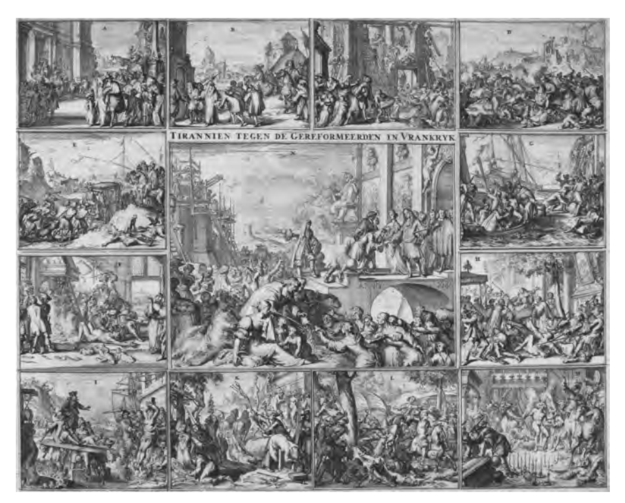
Figure 6. Romeyn de Hooghe, Tyrannies against the Reformed in France , 1686, reproduced with permission from the Rijksmuseum, Amsterdam.

refugees, supported by the Republic's dignitaries; Dutch men and women generously handing out food and money to the despaired newcomers; in the background a new church being built; a story that ends with a new beginning.<sup>110</sup>