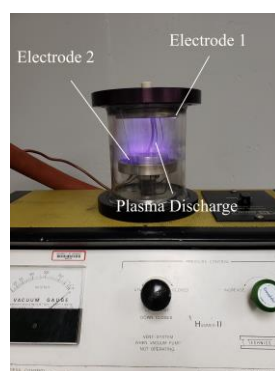
Figure 1: Technics Hummer II sputtering chamber triggering a DC cold plasma discharge at 30mA that ionizes the Titan-simulated N 2 -CH 4 (90%-10%) gas mixture to produce tholins after several days.

mixture (simulating Titan's atmosphere) to synthesize Titan tholins (as seen in Figure 1). Chamber conditions of 0.5 Torr to 3.00 Torr were maintained at room temperature for approximately 3 days with a continuous flow of the N 2 -CH 4 gas mixture.