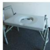
Toilets and Accessories Bariatric commode with drop arms (300 to 500 lbs.)