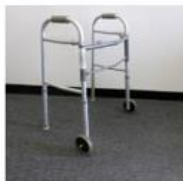
Walkers Walker with front wheels