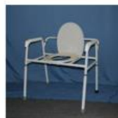
Toilets and Accessories Bariatric commode (300 to 500 lbs.)