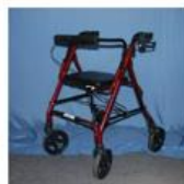
Walkers 4-wheel walker with seat (up to 290 lbs.)