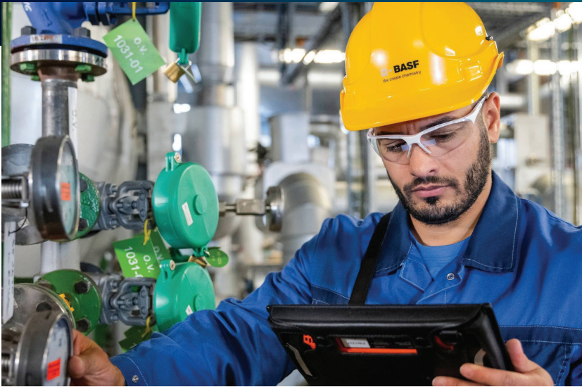
Xemium production runs 24 hours a day, 365 days per year and involves both continuous and batch processes as well as laboratory analyses for quality control and end-of-line packaging.

Xemium®, an active and environmentally safe fungicide combining a high intrinsic activity against a range of fungi and a unique mobility in the entire plant. This results in highly reliable crop protection for greater yields, helping growers combine profitability with environmental protection.