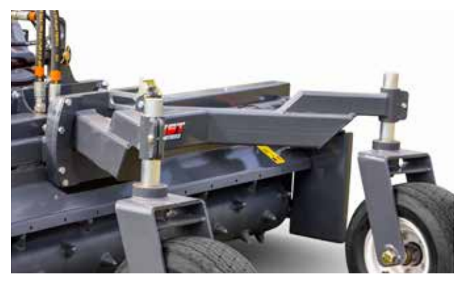
OSCILLATING GAUGE WHEELS

These 3PH PTO driven RotoRakes are equipped with hydraulic angle as a standard feature, with similar options as skidsteer models.