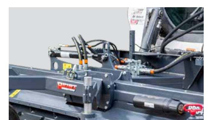
DIVERTER VALVE CONTROLLED HYDRAULIC KIT (Optional)

This hydraulic option for the RotoRake allows you to control the tilt and angle of the RotoRake by diverting the flow of oil. You can choose either one or both of these options. Note: Rotor stops turning while these functions are in use.