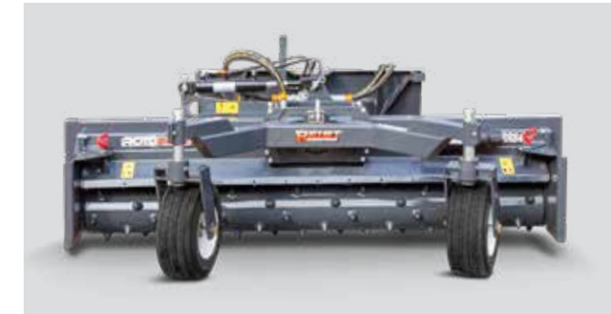
RR84 Model Shown with Hydraulic Angle & Tilt Option

The RotoRake's 10" diameter hydraulic bi-directional rotor allows for operation in both directions, making it easier to clear your land reducing the time needed to start your next pass.