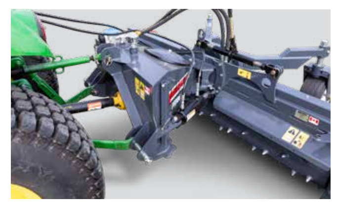
PTO DRIVEN ROTOR

Oscillating gauge wheels lock in level position for the (PTO) three point hitch use.