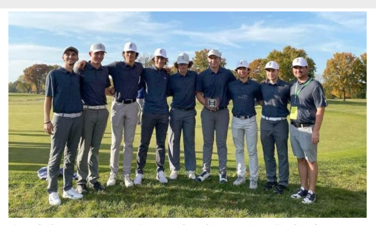
Boys Golf took 4th place in the Division 1 State Championship at The Ohio State University Golf Club on Oct. 21-22.