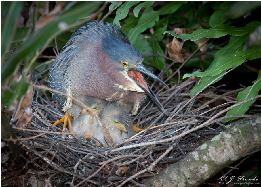
Fig. 3. Nest of green heron with adult and juveniles.

[ http://www.swartzentover.com/cotor/Photos/Hiking/Birds/BirdPages/GreenHeron.html , downloaded 17 October 2014]