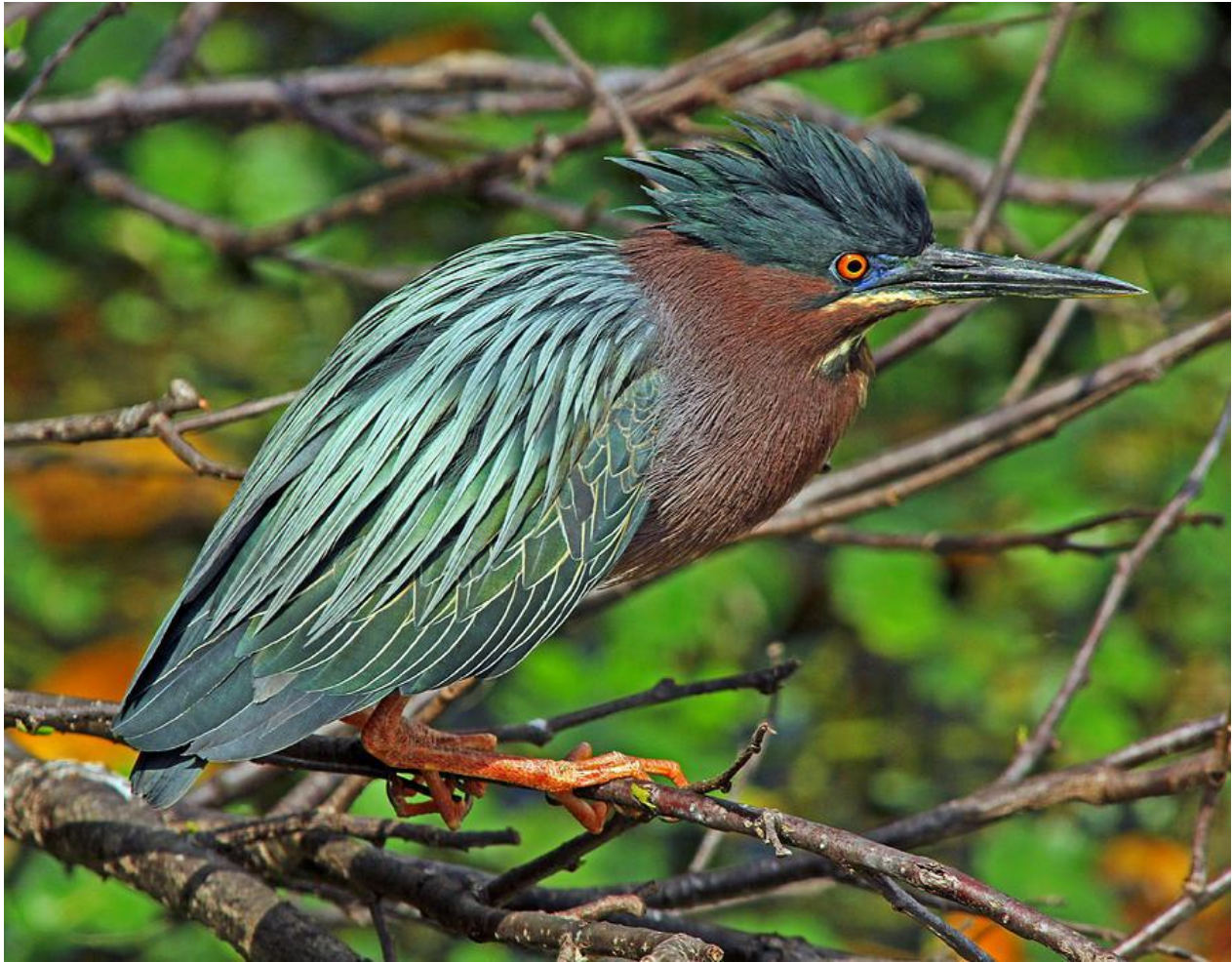
Fig. 1. Green heron, Butorides virescens .

[ http://fineartamerica.com/featured/green-heron-breeding-larry-nieland.html , downloaded 17/10/14]