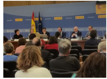
Left: Global Forum of Local Gov. 22-24 th Nov. Center: Annual ORU-Fogar General Assembly, 27-28 th Nov. Right: The Spanish New Urban Agenda, 30 th Nov.