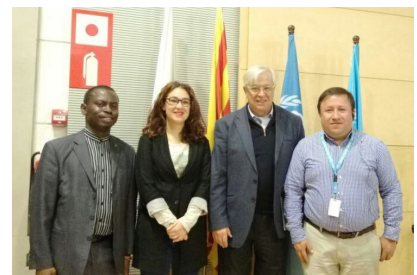
Left: The right in the city. Legal implementation of the NUA. Madrid 10-12 th July. Center: Sharing design, innovation and technology for the city prosperity, by ESNE, 25-27 October. Right: Barcelona City Lab on Safer Cities, Barcelona 14 th November.