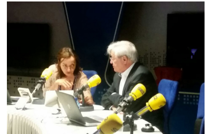
Left: Interview of Joan Clos at Onda Cero. Center: Media at the EGM Planning Compact Cities, Seville. Interview of Joan Clos at Hoy por Hoy.

23 · http://www.rtve.es/alacarta/videos/los-desayunos-de-tve/desayunos-tve-joan-clos-director-onu-habitat/3885331/