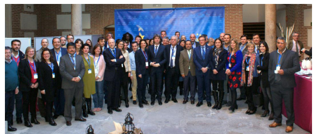
Transparent and Open Cities, Madrid, 8-10 th Feb.

» Support to "Transparent and Open Cities" organized by Uraia and FEMP (Spanish Federation of Cities and Regions). Madrid, 8-10 th February.