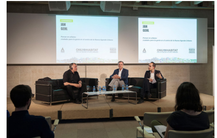
Left: SDGs and its implementation: contributions to Spain. 27 nd March. Center: Challenges and strategies of local governments. Madrid, 9 nd May. Right: Thinking Urban: cities for the people at the center of the NUA, Madrid, 29 nd June