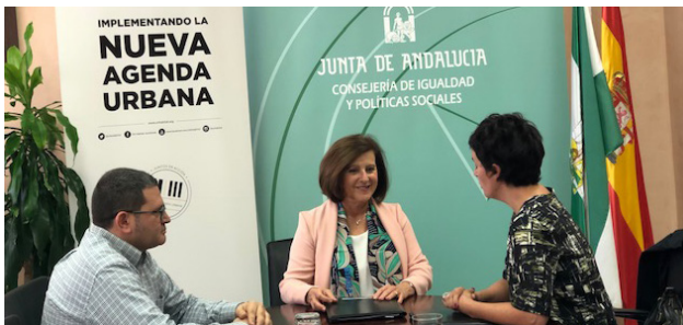
Signing Collaboration Agreement with AACID