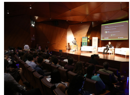
Left: SDGs and the New Urban Agenda: Together in Action. Center: Implementing the New Urban Agenda in Spain. Right: New Realities, New Solutions: Implementing the New Urban Agenda