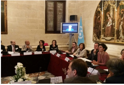
EGM Planning Compact Cities, Seville 13-14 th March.