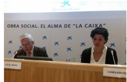
Left: The New Urban Agenda, a compromise for prosperity, at TYPESA 26 th January. Center: UN-Habitat and the NUA. Right: Forum on the New Urban Agendas at a Global and European level Madrid 2 nd March