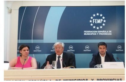
Left: Urbanization at the Mediterranean, by IEMed, Barcelona 12 th June. Center: The New Urban Agenda, an urban paradigm shift for XXI century Barcelona 12 th June. Right: Meeting of Territorial Council to promote the adoption of the NUA, Madrid 27 th June