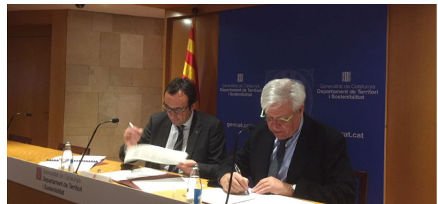
MoU - Dep. of Territory and Sustainability, Gov. of Catalonia.