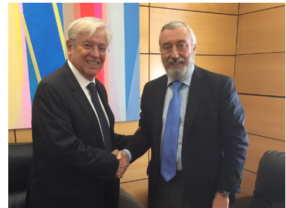
Left: Meeting with Alfonso Dastis (Minister of Foreign Affairs). 19 th Dec. Center: Meeting with Ildefonso Castro (Secretary of State for Foreign Affairs). 26 th June. Right: Meeting with Julio Gomez Pomar (Secretary of State for Infraestructure, Transport and Housing at Ministry of Development). 27 th June