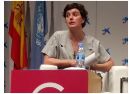
Left: United Nations Day Celebration. Madrid, 24 th October. Center: United Nations Decade about Nourishment (2016-2025) and its implementation in Spain, by FAO. Madrid, 4 th December. Right: IV Congress of Childhood Friendly Cities, by UNICEF. Madrid, 13 th Sep.