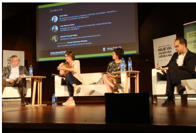
New Realities, New Solutions: Implementing the NUA, Madrid, 29-30 th June