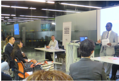
World Forum on Urban Violence, Madrid, 19-21 st April