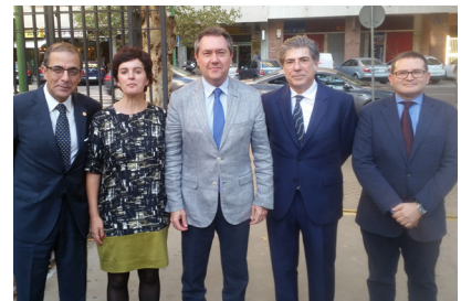
Left: Urban Breakfast. Barcelona 13 th June. Center: World Habitat Day. Right: World Cities Day at Seville University