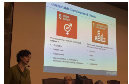
Left: The New Urban Agenda and its implementation process as a Development and Prosperity Tool. Seville 24 th November. Center: The implementation of the 2030 Agenda and the NUA of UN-Habitat in Europe. Madrid 30 th November. Right: The roadmap of the NUA in Spain- IV International Engendering Congress beyond SDG#5: Gender at 2030 Agenda of Sustainable Dev. Madrid 11 th December