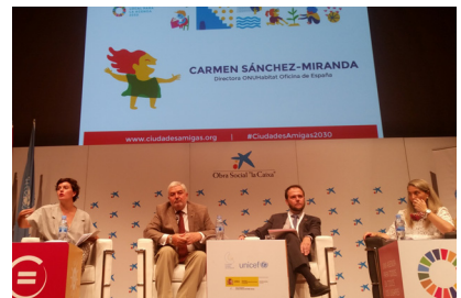
Left and Center: SDGs and the NUA: Together in action. Madrid 26 th Jan. Right: IV Congress of Childhood Friendly Cities, by UNICEF. Madrid, 13 th Sep.