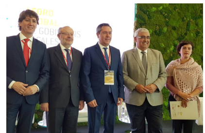
Left: Towards a holistic approach to urban resilience, Madrid 22 nd November. Center: Golden Experience Award on Sustainability, given by Seville City Council to UN-Habitat Spain. Seville 22 nd November. Right: I Global Forum on Local Governments: Destination Seville, Seville 23 th November.