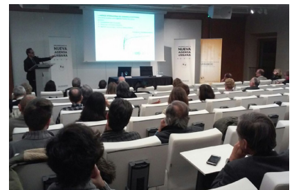
Left: Opening of the course of IBEI, Barcelona 15 th November. Center and right: Urban planification: building the path to the SDGs, Madrid 22 nd November