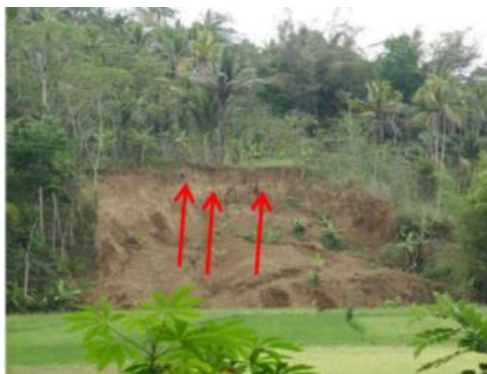
Figure 3.1. Cracking in the main scarp

The physical characteristics of the surface soil in active landslides showed a higher variation than those in inactive landslides. Active landslides showed that there were still visible cracks in the lowlands (Figure 3.1), water seepage (Figure 3.2), sparse land cover, and steep slope conditions (table 3.2). Active landslides indicated the condition of the soil material which stolen actively moving. Masrurroh (2016) explained that active landslides provided an overview of the mixed soil condition, so it has sparse vegetation and looks brown. Mixing soil at different types of landslides caused the topsoil and subsoil to mix, so soil characteristics' distribution varied. Noviyanto et al. (2020) added that active landslides caused a change in soil morphology in the body and legs to become irregular, so it caused a higher variation of physical characteristics of the surface soil.