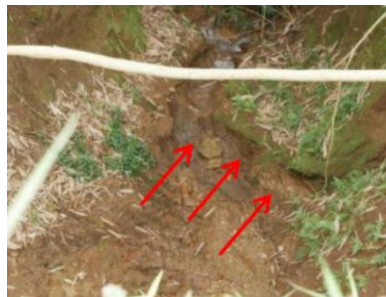
Figure 3.2. Water Seepage on Active Landslide

values, so the soil permeability was also more diverse (Table 3.1). According to Chen (2009), soil permeability has a dynamic value where the relationship between porosity, organic matter, texture, slope, and land cover can be controlled.