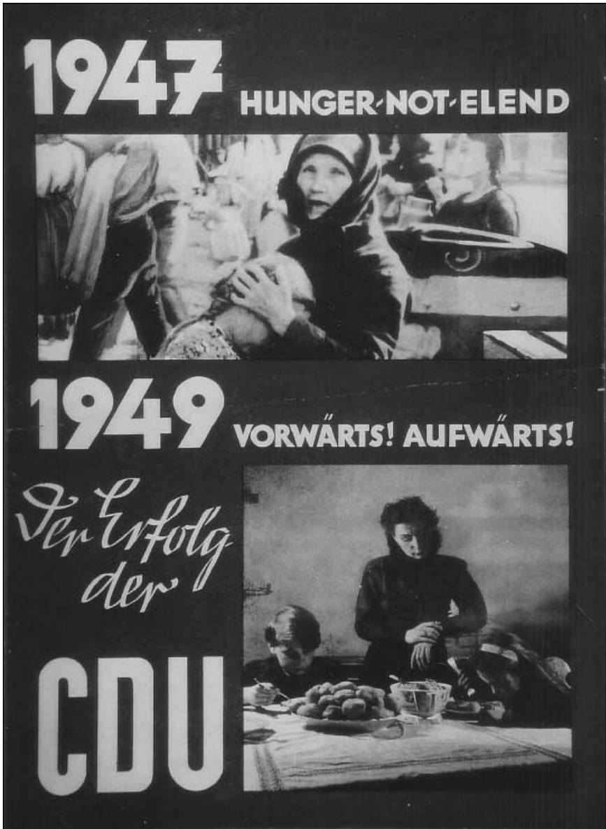
Illustration 2.4 The success of the CDU

CDU, then: It should get even better” coupled with the graphic transformation of a gaunt woman holding an empty shopping basket, her hand filled with ration cards (Illustration 2.5). As the years progress and her basket fills, she becomes ever more attractive, full figured, and younger looking, suggesting that the work burden and hunger of the immediate postwar years had not only made difficult the