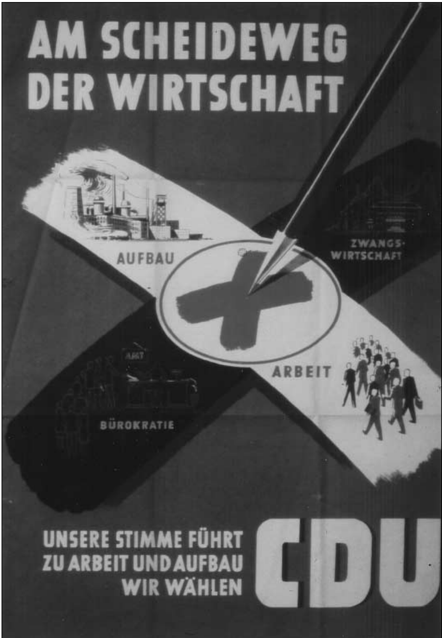
Illustration 2.1 At the crossroads of the economy