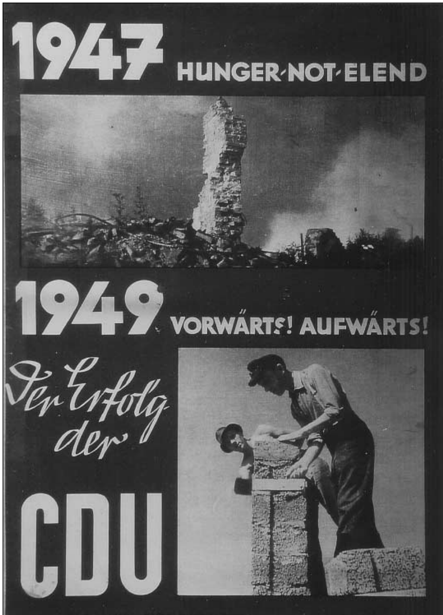
Illustration 2.6 The success of the CDU