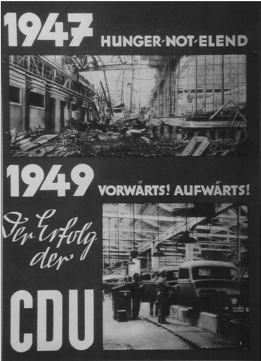
Illustration 2.7 The success of the CDU

What is striking about the propaganda produced by the national-level CDU/CSU organization is that most of it did not, in general, deal head on with the Christian concerns of the party. Only one of the Arbeitsgemeinschaft-supplied leaflets touched upon such a concern. The Rhineland CDU, which was battling the Center Party for votes, complained that none of the posters dev-