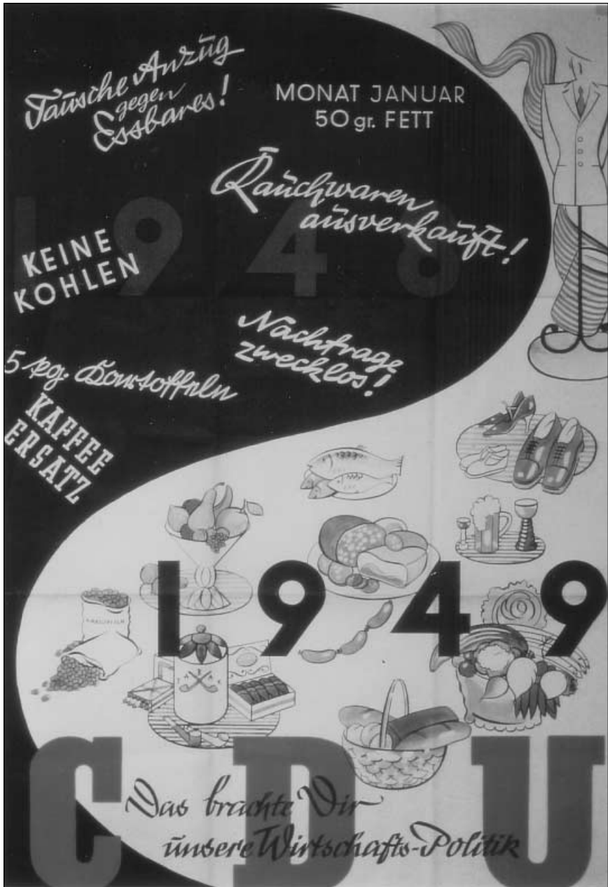
Illustration 2.2 This is what our economic policy provides you