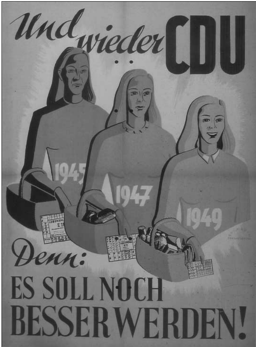
Illustration 2.5 It should get even better!

task of meeting basic needs but also robbed her of her sexual appeal. Not surprisingly, any reference to the common postwar occurrences of rape, fraternization, or cohabitation with a man not a woman's husband were completely silenced in the CDU/CSU posters, saving West Germans from a difficult confrontation with the immediate past. Taken altogether, the CDU/CSU posters indicated the sense that women were becoming more feminine as they regained their role as con-