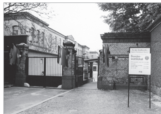
Entry Prenzlauer Allee, 1989

The site exemplifies the SED's use and abuse of power at the communal level, the local Prenzlauer Berg Round Table and the elections in 1990, as well as the reorganization of the borough administration and civic activism in the 1990s.