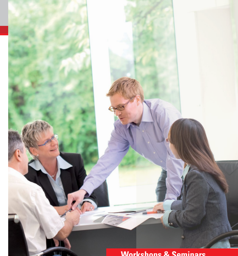
Workshops & Seminars