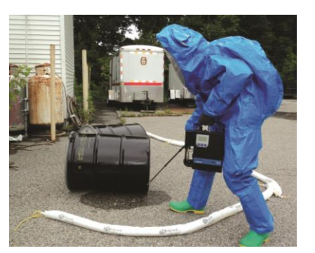
Figure 2. Detecting Leaks from a Chemical Drum Using a Portable FID

response incidents to detect the presence of potentially flammable, explosive, or toxic substances (Figure 2). They are also used for natural gas leak detection, fugitive emissions monitoring, hazardous waste site evaluation,