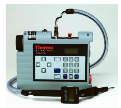
Figure 3. Portable Dual FID/PID Analyzer

Unlike FIDs, PIDs do not require hydrogen or other fuels for operation. Instruments that combine both FID and PID (Figure 3) are capable of detecting a wide range of chemical compounds, both organic and inorganic, and may be more convenient to use and maintain than