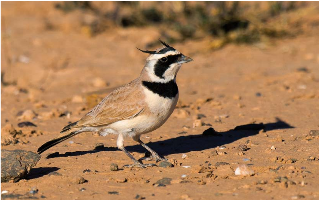
235 Temminck's Lark / Temmincks Strandleeuwerik Eremophila bilopha , Goulimine, Lower Draa, Morocco, 30 January 2013