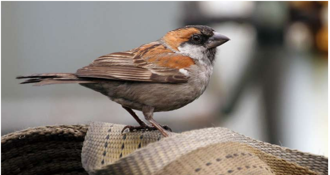
201 Iago Sparrow / Kaapverdische Mus Passer iagoensis , male, on board of MV Plancius , Hansweert, Zeeland, Netherlands, 20 May 2013 (Gerjon Gelling)