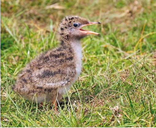
180 Gull-billed Tern / Lachstern Gelochelidon nilotica , chick, Neufelderkoog, Schleswig-Holstein, Germany, 28 June 2012 (Sebastian Conradt)