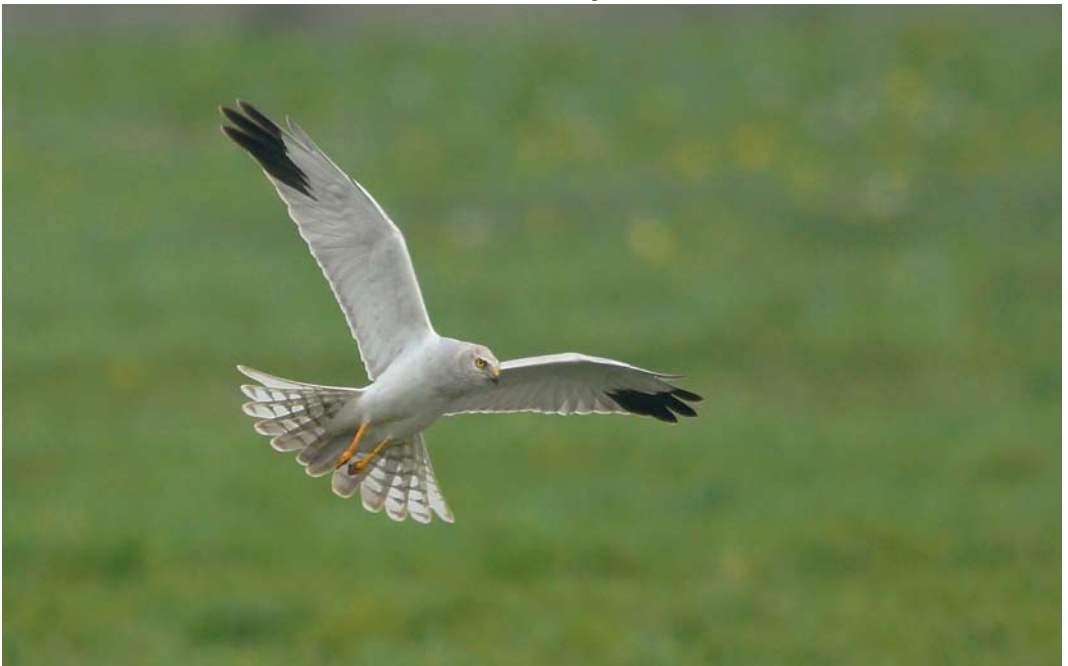
267 Steppekiekendief / Pallid Harrier Circus macrourus , mannetje, Buinerveen, Drenthe, 5 april 2014 (Jan den Hertog)