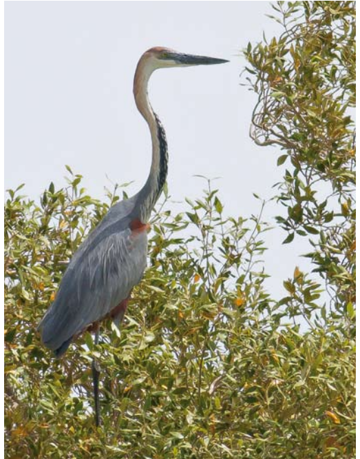
245 Pacific Eider / Pacifische Eider Somateria mollissima v-nigrum , adult male, with Common Eiders / Eiders S. mollissima and King Eiders / Koningseiders S. spectabilis , Vardø, Finnmark, Norway, 21 March 2014 246 Goliath Heron / Reuzenreiger Ardea goliath , adult, Hamata, Egypt, 16 April 2014 247 Green Heron / Groene Reiger Butorides virescens , second calendar-year, São Miguel, Azores, 16 April 2014