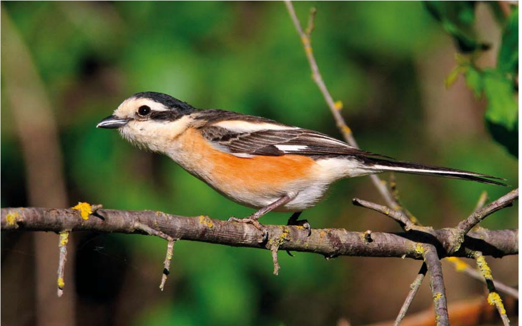
264 Masked Shrike / Maskerklauwier Lanius nubicus , adult female, Mérida, Navarra, Spain, 13 April 2014