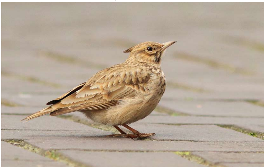
280 Kuifleeuwerik / Crested Lark Galerida cristata , Haverleij, 's-Hertogenbosch, Noord-Brabant, 5 april 2014 (Roland Wantia)