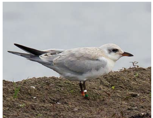
185 Gull-billed Terns / Lachsterns Gelochelidon nilotica , with Black-headed Gulls / Kokmeeuwen Chroicocephalus ridibundus , Schagerbrug, Noord-Holland, Netherland, 3 August 2008 186 Gull-billed Terns / Lachsterns Gelochelidon nilotica , Nieuwe Pekela, Groningen, Netherlands, 5 August 2013 187 Gull-billed Terns / Lachsterns Gelochelidon nilotica , adult feeding juvenile, Schagerbrug, Noord-Holland, Netherlands, 21 August 2012 188 Gull-billed Tern / Lachstern Gelochelidon nilotica , juvenile, Schagerbrug, Noord-Holland, Netherlands, 11 August 2012. Note colour-rings.