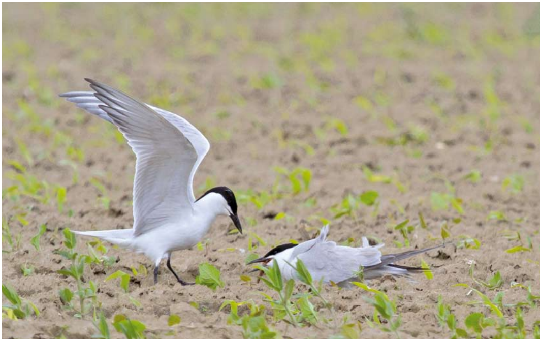
182 Gull-billed Terns / Lachsterns Gelochelidon nilotica , male (left) and female during courtship, Nordkehdingen, Niedersachsen, Germany, 2 June 2013 (Gerd-Michael Heinze)

To improve and develop the conservation plan each year, data on diet and feeding areas are very important. Gull-billed Terns, contrary to other tern species, need inland feeding grounds such as moors and wet meadows with fresh and brackish water. Prey from the sea or salt marshes is normally not taken, especially when they raise their chicks, as the young birds do not tolerate salt. The adults forage in the vicinity of the colony for worms and insects. This is what the young chicks need in their first days. Later, the adults feed their young with mice, frogs and also various young birds. These are collected at up to 5-10 km distance from the colony. A speciality of the Neufelder Gull-billed Terns is catching (introduced) Chinese Mitten Crabs Eriocheir sinensis in the river and the Neufelder harbour, where the birds can be observed extremely well. Because the hinterland of Dithmarschen has less ecological value, the birds fly also to the other side of the Elbe in Niedersachsen, where they can find plenty of lizards.