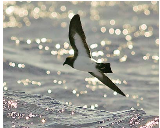
193-195 Titan Storm Petrel / Titanstormvogeltje Fregetta (grallaria) titan , at sea, near Pitcairn Island, 4 September 2013 196 Titan Storm Petrel / Titanstormvogeltje Fregetta (grallaria) titan , at sea, near Pitcairn Island, 4 September 2013

and we watched the bird for perhaps a minute as it made a circuit of the slick, swept once past the vessel's stern and then headed off into the big blue yonder. The sighting was all too brief but luckily Kenneth Petersen and I were able to snap a few images of the bird, although the lighting was not ideal. For most, it was their first White-bellied Storm Petrel of any type but for the cognoscenti on board (including myself, Bob Flood and Kirk Zufelt) it was a grail among storm petrels, a bird we never thought we would see.