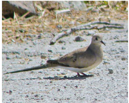
254 Pallas's Gull / Reuzenzwartkopmeeuw Larus ichthyaetus , second-winter, with Black-headed Gull / Kokmeeuw Chroicocephalus ridibundus , Sollana, Albufera de València, València, Spain, 21 March 2014 ( Toni Alcocer ) 255 Cape Gull / Afrikaanse Kelpmeeuw Larus dominicanus vetula , adult, Ondarroa, Bizkaia, Spain, 21 April 2014 ( Juan Carlos Andrés ) 256 Sociable Lapwing / Steppekievit Vanellus gregarius , Fehmarn, Schleswig-Holstein, Germany, 26 April 2014 ( Martin Gottschling ) 257 Namaqua Dove / Maskerduif Oena capensis , Lesvos, Greece, 15 May 2014 ( Derek Charlton )

Gelderland, from 18 January stayed until 8 May. A first-summer Steppe Grey Shrike L. lahtora pallidirostris at Maasvlakte from 29 April to 3 May was the third for the Netherlands and the first in spring. An adult female Masked Shrike L. nubicus between Mérida and Santacara, Navarra, on 2-14 April was the third for Spain. Photographs of the first Black-naped Monarch Hypothymis azurea for Iran near Jask, Hormozgan, on 13 February 2011 were published in Sandgrouse 36: 61-62, 2014. In the Netherlands, a reportedly unringed Azure Tit Cyanistes cyanus was photographed near Maashorst, Noord-Brabant, on 19 April; one wearing a blue ring was found 250 km to the north near Noordpolderzijk, Groningen, on 29 April. A Greater Hoopoe-Lark Alaemon alaudipes on Comino on 8-13 April was the first for Malta since 1984. A Eurasian Crag Martin Ptyonoprogne rupestris was present at Flamborough Head, East Yorkshire,