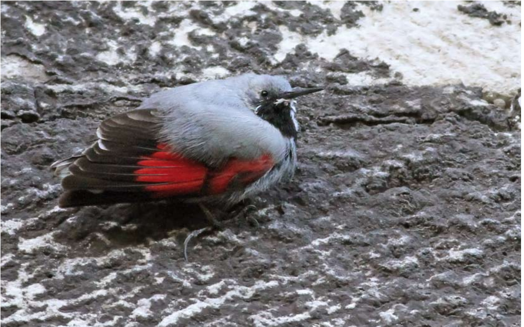
250 Wallcreeper / Rotskruiper Tichodroma muraria , male, Basilique de Cointe, Liège, Liège, Belgium, 21 March 2014 ( Robin Gailly )