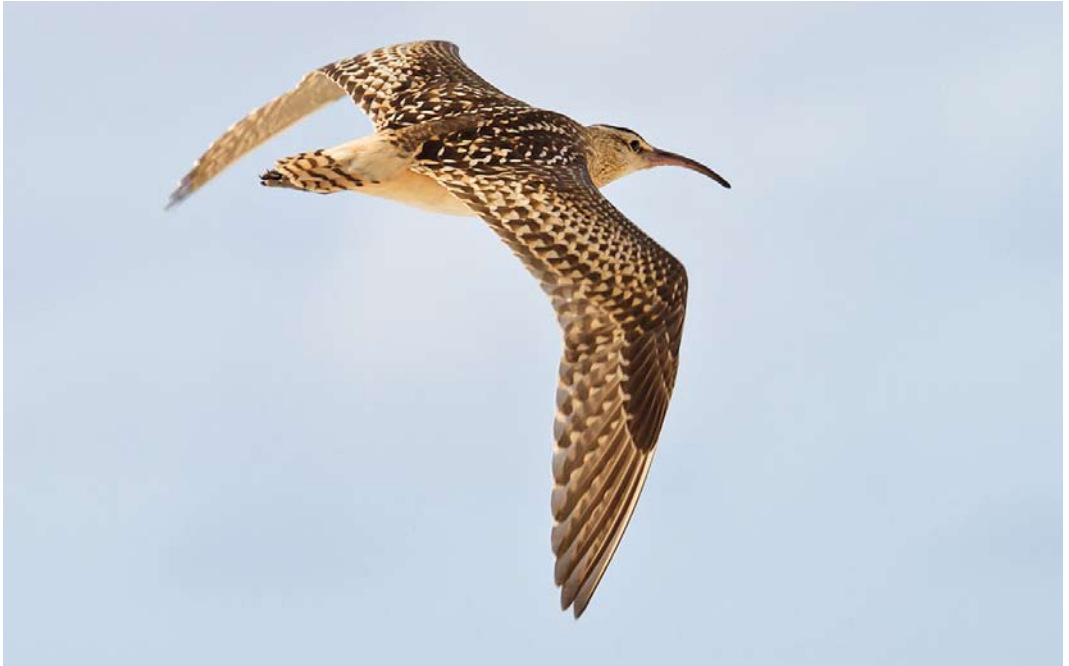
217 Bristle-thighed Curlew / Zuidzeewulp Numenius tahitiensis, juvenile, Henderson Island, Pitcairn Islands, 7 September 2013. Note uniformly fresh plumage. Rump colour varies from pale buff to rich cinnamon (cf plate 219). 218 Bristle-thighed Curlew / Zuidzeewulp Numenius tahitiensis, juvenile, Henderson Island, Pitcairn Islands, 7 September 2013. Cf other juvenile in plate 220 to show variation in overall plumage saturation.