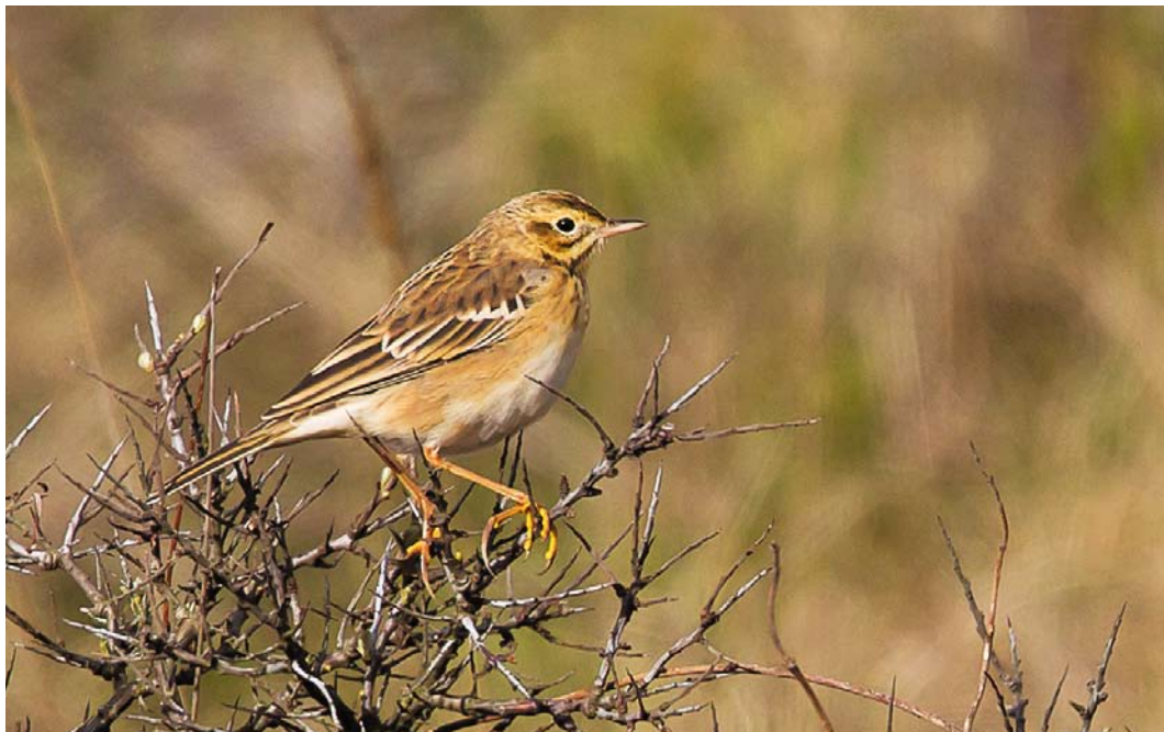
279 Grote Pieper / Richard's Pipit Anthus richardi , Texel, Noord-Holland, 18 april 2014