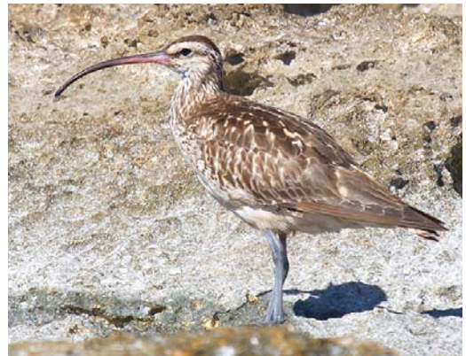
222 Bristle-thighed Curlew / Zuidzeewulp Numenius tahitiensis , adult-type, Oeno Island, Pitcairn Islands, 10 September 2013. Note very heavily worn plumage with some fresher scapulars apparent (cf plate 213-214 and 221 showing second calendar-year birds); extreme wear may indicate oversummering bird.

221). They differ from juveniles in having stronger wear to the scapulars, upperwing-coverts and tertials, all of which lack the uniform-generation as-