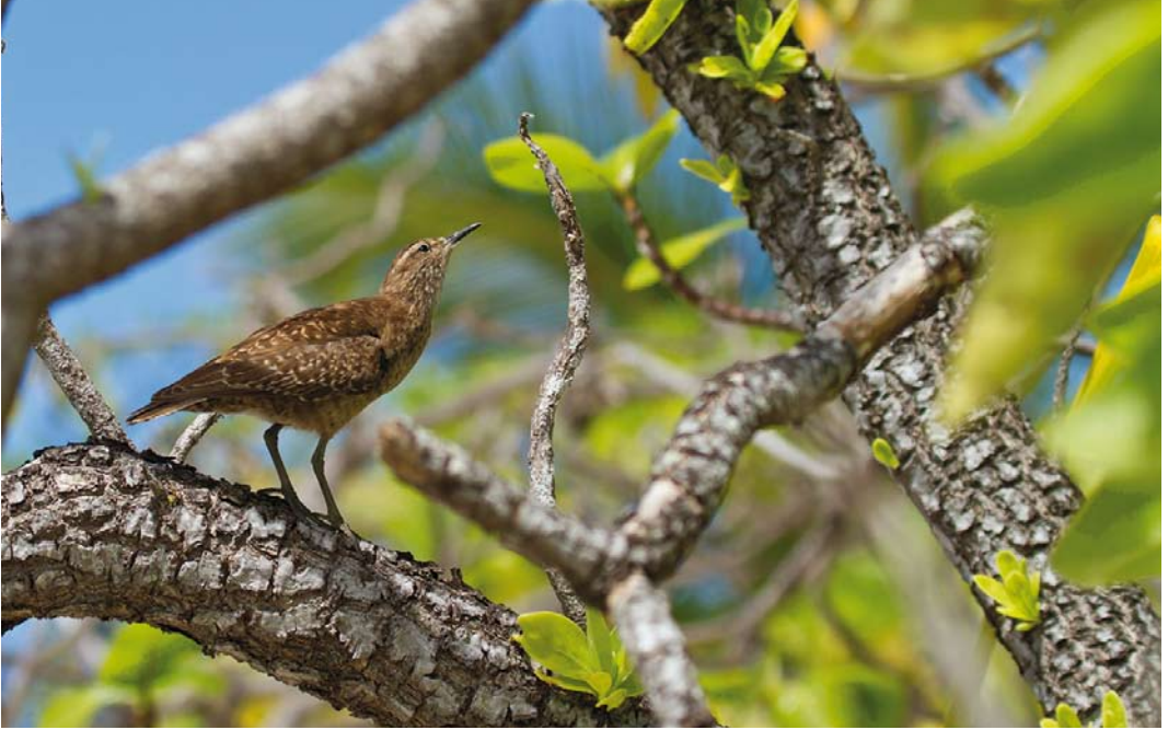
228-229 Tuamotu Sandpiper / Tuamotustrandloper Prosobonia parvirostris , Tenararo Atoll, French Polynesia, 12 September 2013. Foraging on nectar in tree.