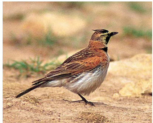
231 Temminck's Larks / Temmincks Strandleeuweriken Eremophila bilopha , Gleb Jdiane, Dhakla, Oued Ad-Deheb, Western Sahara, Morocco, 12 January 2012 (Arnaud B van den Berg/The Sound Approach) 232 Colombian Horned Lark / Colombiaanse Strandleeuwerik Eremophila alpestris peregrina , Vereda Fute, Cundinamarca, Colombia, 3 February 2006 (Maria Angela Echeverry-Galvis) 233 Colombian Horned Lark / Colombiaanse Strandleeuwerik Eremophila alpestris peregrina , Tominé, Cundinamarca, Colombia, 2000 (Thomas McNish)

(mtDNA) and two types of nuclear DNA were investigated (Drovetski et al 2014). The mtDNA analysis had a surprise in store: the Tibetan form elwesi turned out to be the sister group to all other horned larks, split off c 1.5 million years ago (mya). The remaining Eremophila split into three groups c 1 mya: 1 Temminck's Lark; 2 Atlas Horned Lark and the Caucasian penicillata group; and 3 the remaining Holarctic forms. The latter group could be divided into the tundra-breeding Shore Lark ( flava ), the steppe-dwelling brandti and American Horned Lark ( alpestris group). In American Horned Lark, five mtDNA clades were identified. Four of these were geographically restricted, while one was widespread – and none were linked to single subspecies. It seems likely that the understudied