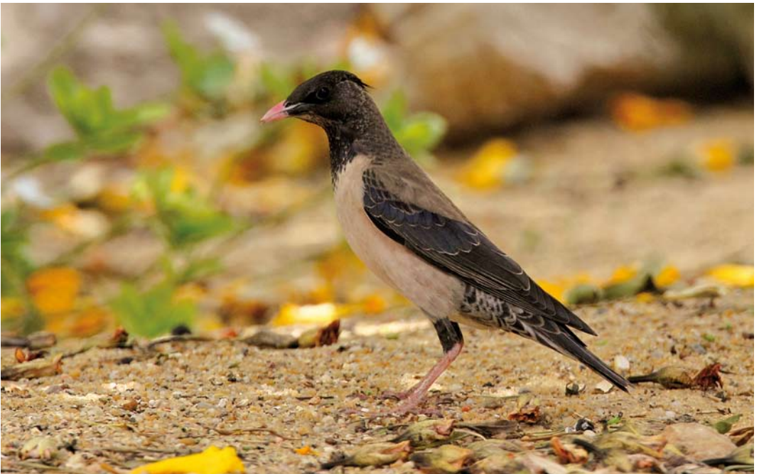
265 Rosy Starling / Roze Spreeuw Pastor roseus , second calendar-year male, El Gouna, Egypt, 7 May 2014