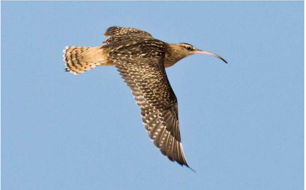
219 Bristle-thighed Curlew / Zuidzeewulp Numenius tahitiensis, second calendar-year, Oeno Island, Pitcairn Islands, 10 September 2013. Note relatively fresh plumage (versus worn adult at this season), but not uniformly fresh aspect of juvenile (cf plate 217). 220 Bristle-thighed Curlew / Zuidzeewulp Numenius tahitiensis, juvenile, Henderson Island, Pitcairn Islands, 7 September 2013. Cf other juvenile in plate 218 to show variation in overall plumage saturation.