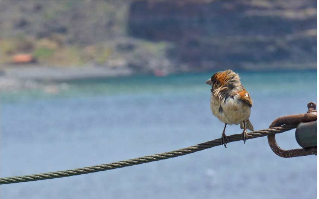
198 Iago Sparrow / Kaapverdische Mus Passer iagoensis , male, on board of MV Plancius , off Deserta Grande, Desertas, 12 May 2013