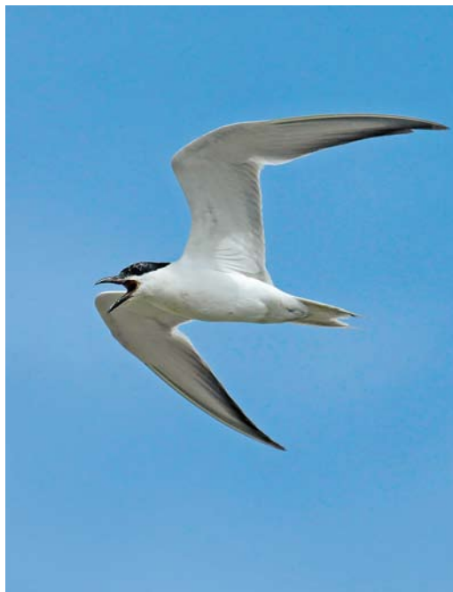
184 Gull-billed Tern / Lachstern Gelochelidon nilotica , adult, Waarland, Noord-Holland, Netherlands, 12 August 2013