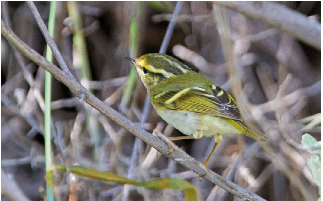
253 Pallas's Leaf Warbler / Pallas' Boszanger Phylloscopus proregulus , Lesvos, Greece, 8 May 2014