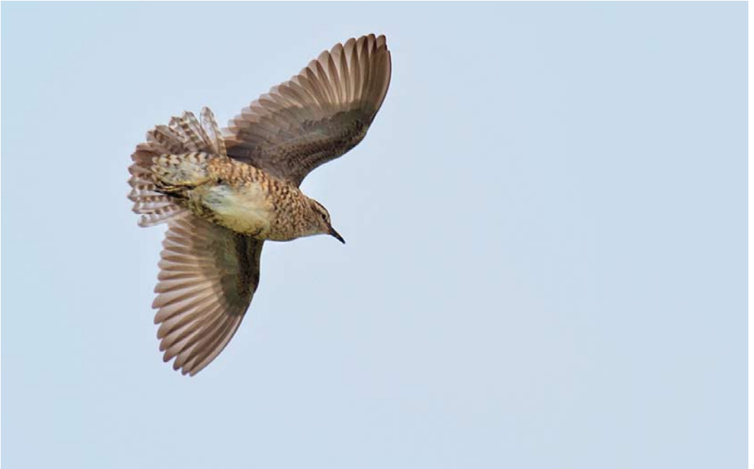
224-225 Tuamotu Sandpiper / Tuamotustrandloper Prosobonia parvirostris , Morane Atoll, French Polynesia, 14 September 2013 (Steve N G Howell)