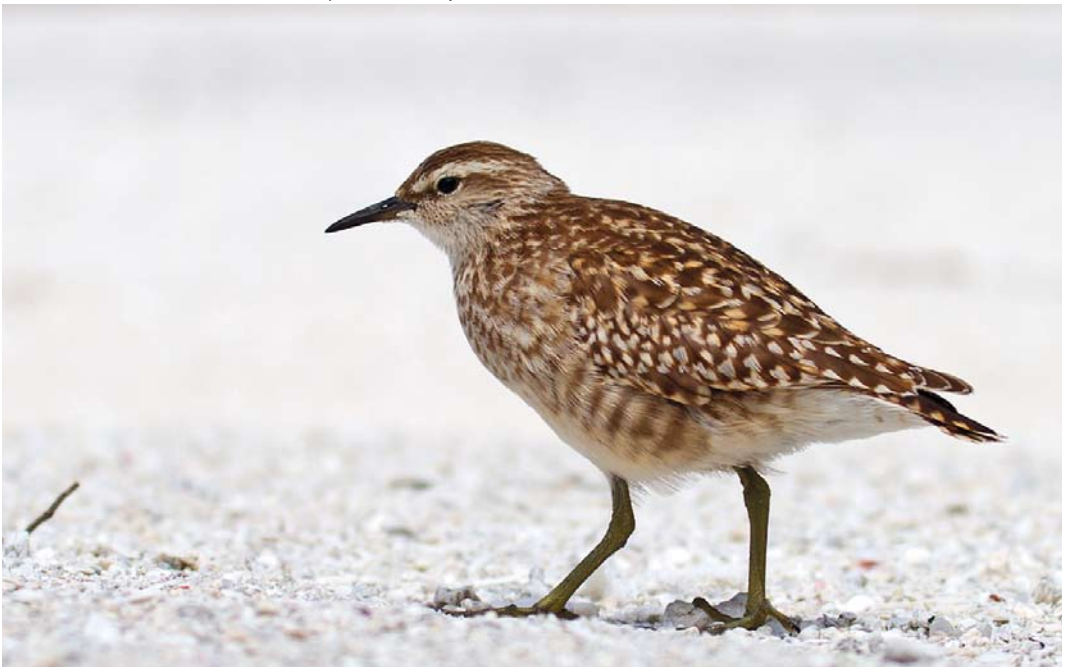
227 Tuamotu Sandpiper / Tuamotustrandloper Prosobonia parvirostris , pale morph, Tenararo Atoll, French Polynesia, 12 September 2013 (Steve N G Howell)