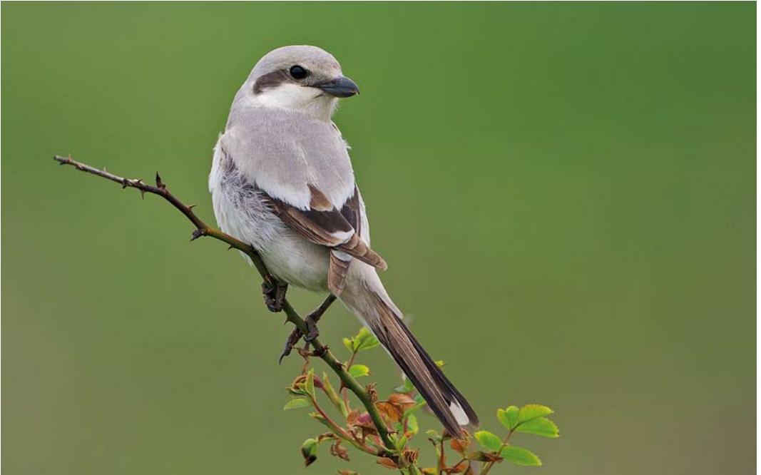
209 Steppeklapekster / Steppe Grey Shrike Lanius lahtora pallidirostris , Stuifdijk, Maasvlakte, Zuid-Holland, 30 april 2014 (Co van der Wardt)