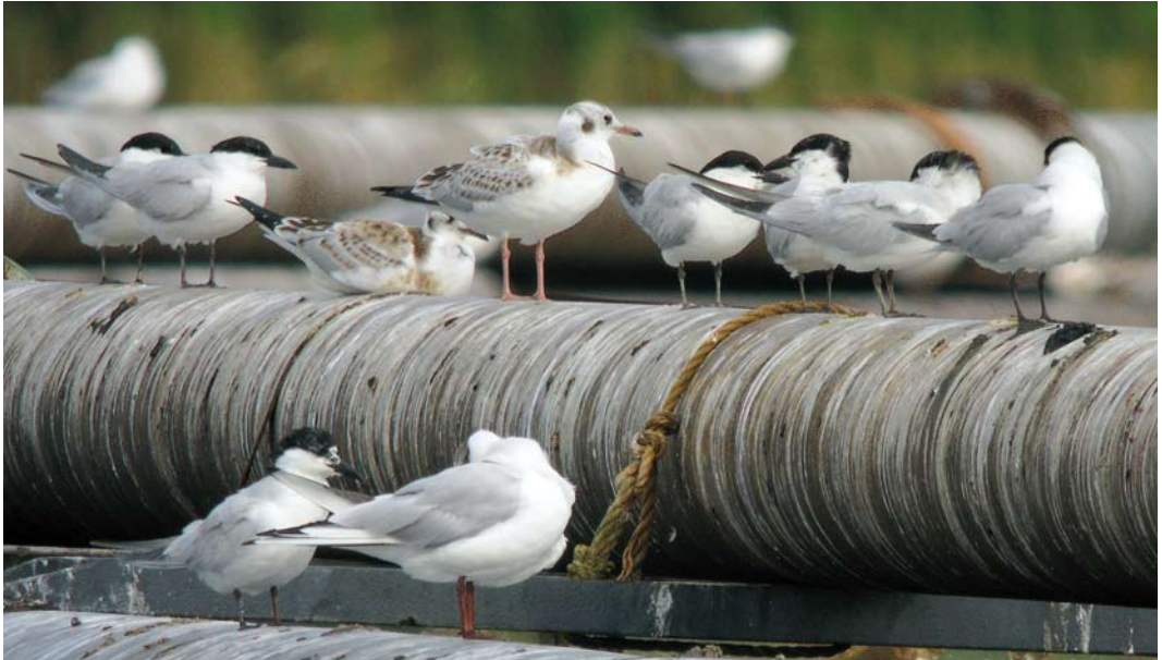
189 Gull-billed Terns / Lachsterns Gelochelidon nilotica , with Black-headed Gulls / Kokmeeuwen Chroicocephalus ridibundus , Nieuwe Pekela, Groningen, Netherlands, 29 July 2013

fledging. In 1988-2002, an average of 0.96 young per pair was observed. In five out of eight years since 1995, it has been less than 1.0 young per pair (Vlek 2002). This number diminished to 0.49 in 2001-09 and, in 2010, became as low as 0.05 (table 1). During the day, birds can often be found at inundated bulb-fields around Schagen, Noord-Holland, where they hunt for frogs; regularly, the young are still being fed by the parents, as is normal in large terns on early migration. This is a crucial precondition for survival of recently fledged juveniles on migration.