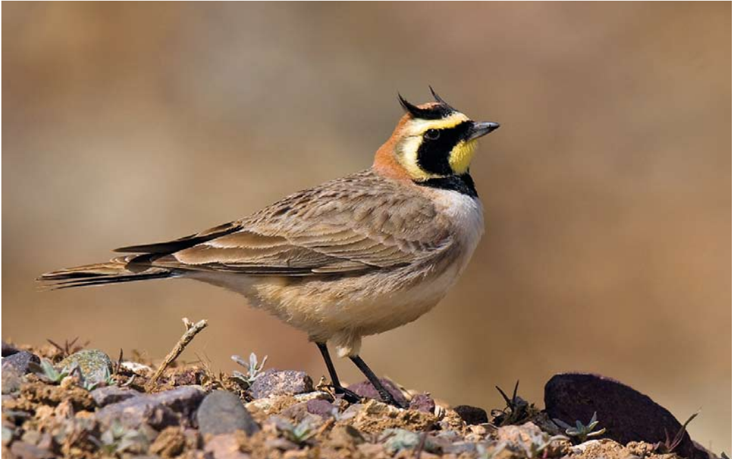
234 Atlas Horned Lark / Atlasstrandleeuwerik Eremophila atlas , Oukaimeden, Western High Atlas, Morocco, 26 March 2009 (Arnoud B van den Berg)