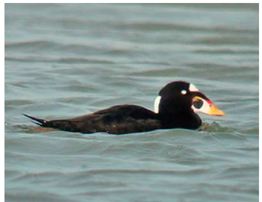
273 Balkanbaardgrasmus / Eastern Subalpine Warbler Sylvia cantillans , eerste-zomer vrouwtje, Reddingsboothuis, Texel, Noord-Holland, 27 april 2014 ( Eric Menkveld ) 274 Witstuitbarmsijs / Coues's Arctic Redpoll Acanthis hornemanni exilipes , Het Twiske, Noord-Holland, 29 maart 2014 ( Eric Menkveld ) 275 Ortolaan / Ortolan Bunting Emberiza hortulana , mannetje, Ruigenhoekse Polder, Utrecht, 30 april 2014 ( Rob Halff ) 276 Kuifleeuwerik / Crested Lark Galerida cristata , Breskens, Zeeland, 5 april 2014 ( Johnny du Burck ) 277 Veldrietzanger / Paddyfield Warbler Acrocephalus agricola , Bergumermeer, Friesland, 13 april 2014 ( Vogelringgroep Bergumermeer ) 278 Brilzee-eend / Surf Scoter Melanitta perspicillata , adult mannetje, Ouddorp, Zuid-Holland, 29 maart 2014 ( Bas de Bruijn )