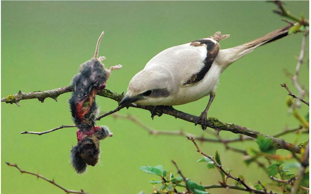
211 Steppeklapekster / Steppe Grey Shrike Lanius lahtora pallidirostris , Stuifdijk, Maasvlakte, Zuid-Holland, 30 april 2014

lange snavel, het zichtbare wit in de dekveren en de relatief lange snavel (korter en hoger bij Kleine). Het wit op de vleugel strekte zich niet (zichtbaar) uit tot op de armpennen, waarmee ook Homeyers Klapekster L. e. homeyeri kan worden uitgesloten. Op foto's van de vogel van de Maasvlakte is te zien zijn dat de vier buitenste armpennen een kleine langwerpige witte vlek op de binnenvlag hadden; dit was echter alleen bij een volledig gespreide vleugel te zien. Het wit is in deze veren bij Homeyers veel uitgebreider. Daarnaast bleken alle handpennen, grote dekveren en de meeste tertials oud en sterk verbleekt, waardoor er geen wit meer in deze veren zichtbaar was. Homeyers heeft bovendien een 'volledig' zwart masker, met donkere teugel en doorgaans een smalle witte wenkbrauwstreep.