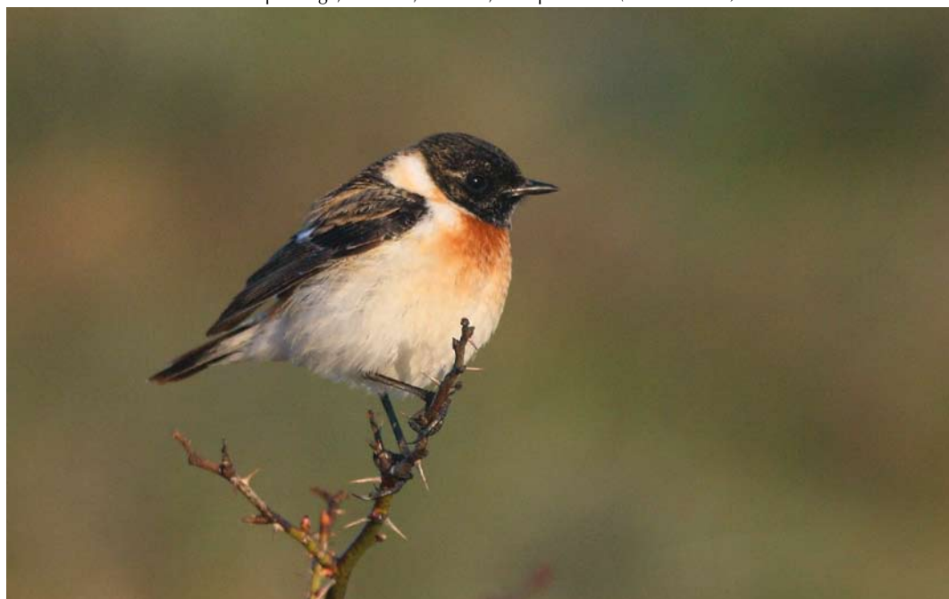
263 Caspian Stonechat / Kaspische Roodborsttapuit Saxicola maurus hemprichii , second calendar-year male, Morups Tånge, Halland, Sweden, 16 April 2014