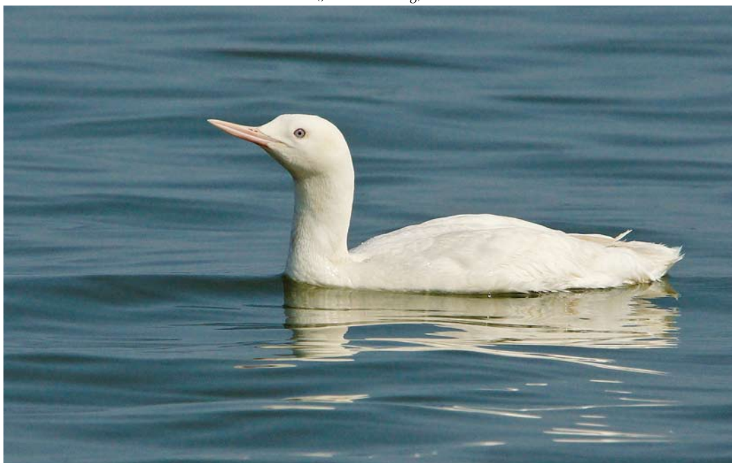
269 Roodkeelduiker / Red-throated Loon Gavia stellata , Eemshaven, Groningen, 30 maart 2014 ( Jan den Hertog )