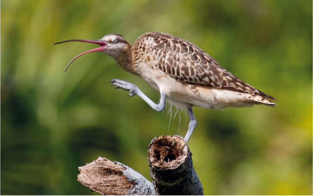
221 Bristle-thighed Curlew / Zuidzeewulp Numenius tahitiensis , second calendar-year, Henderson Island, Pitcairn Islands, 7 September 2013 (Steve N G Howell). Note overall fresh plumage (cf plate 215-216 showing adult-type birds) but retained juvenile outermost primary.

to see in the field but surprisingly easy on photographs.