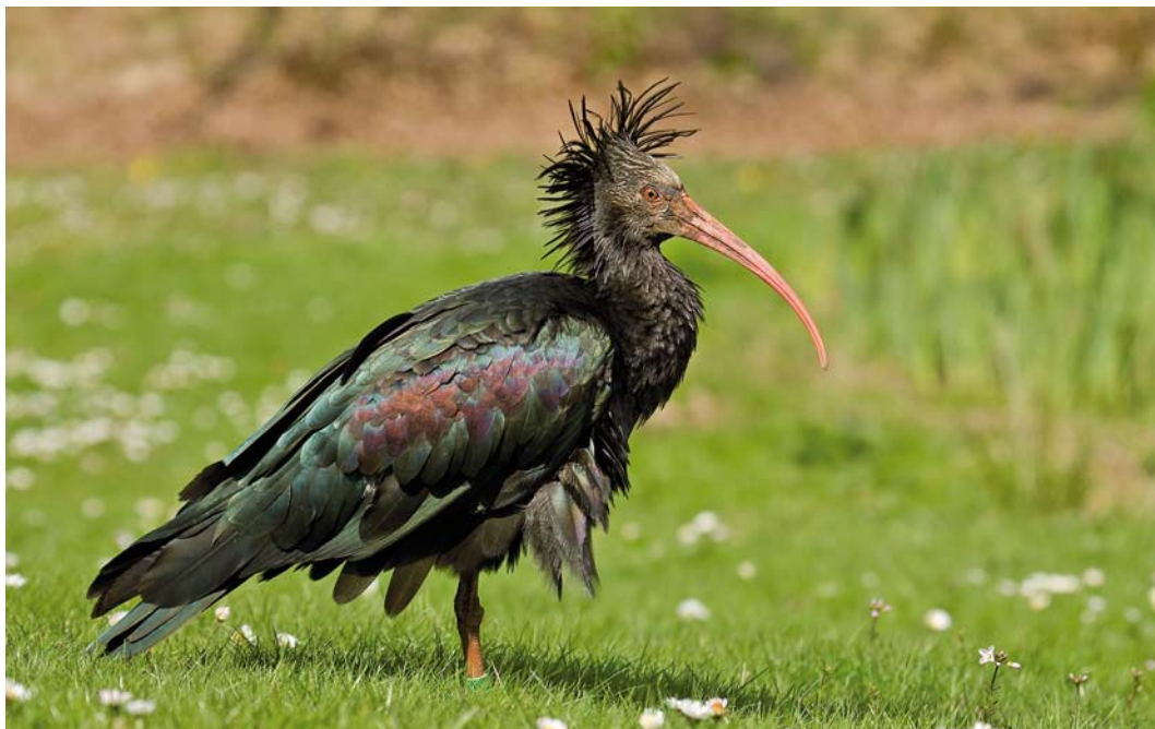
268 Heremietibis / Northern Bald Ibis Geronticus eremita , onvolwassen mannetje, Pageplas, Stadskanaal, Groningen, 14 april 2014