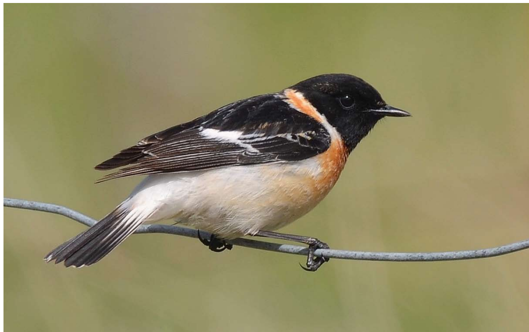
262 Caspian Stonechat / Kaspische Roodborsttapuit Saxicola maurus hemprichii , adult male, Fair Isle, Shetland, Scotland, 30 April 2014 ( Chris Bromley )