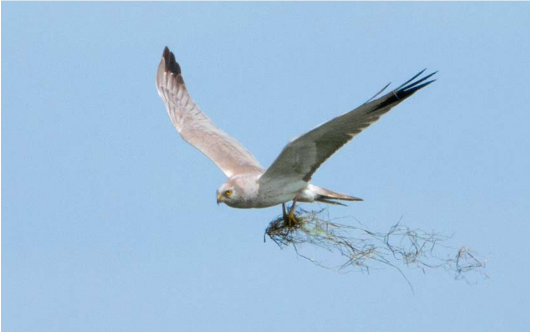
266 Steppekiekendief / Pallid Harrier Circus macrourus , mannetje, Finsterwolde, Groningen, 13 mei 2014 (Co van der Wardt)