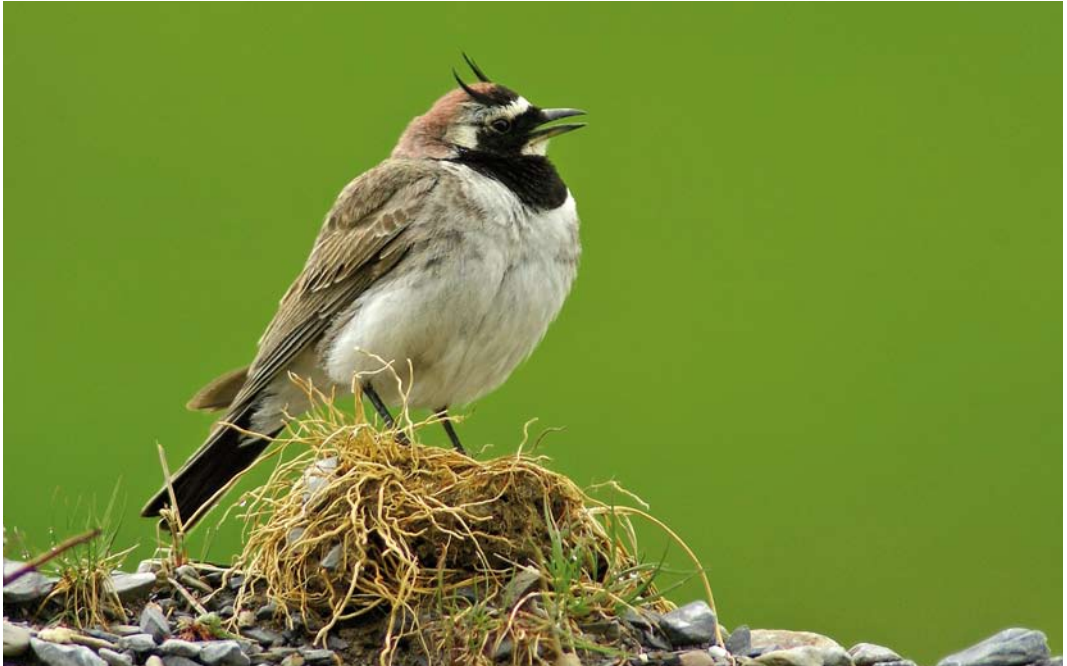
236 Caucasian Horned Lark / Kaukasische Strandleeuwerik Eremophila penicillata , Kazbegi, Georgia, 26 June 2005