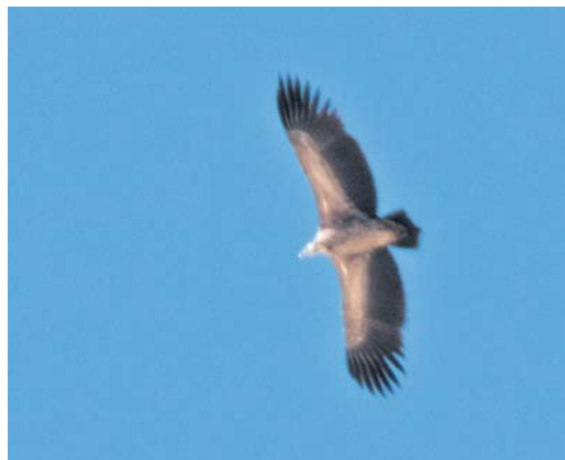
191-192 Himalayan Vulture / Himalayagier Gyps himalayensis , juvenile, near Chahbahar, Sistan-Baluchestan, Iran, 8 December 2010 (Raffael Ayé). Note heavy, broad-winged silhouette and bold creamy streaking of body and axillaries.

reduce the overall size of the white area and the contrast between the white underwing-coverts and the dark remiges.