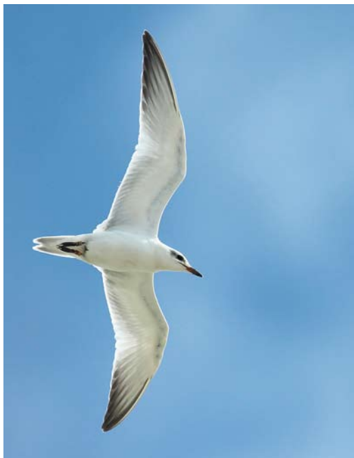
183 Gull-billed Tern / Lachstern Gelochelidon nilotica , juvenile, Waarland, Noord-Holland, Netherlands, 12 August 2013. Note colour-rings.