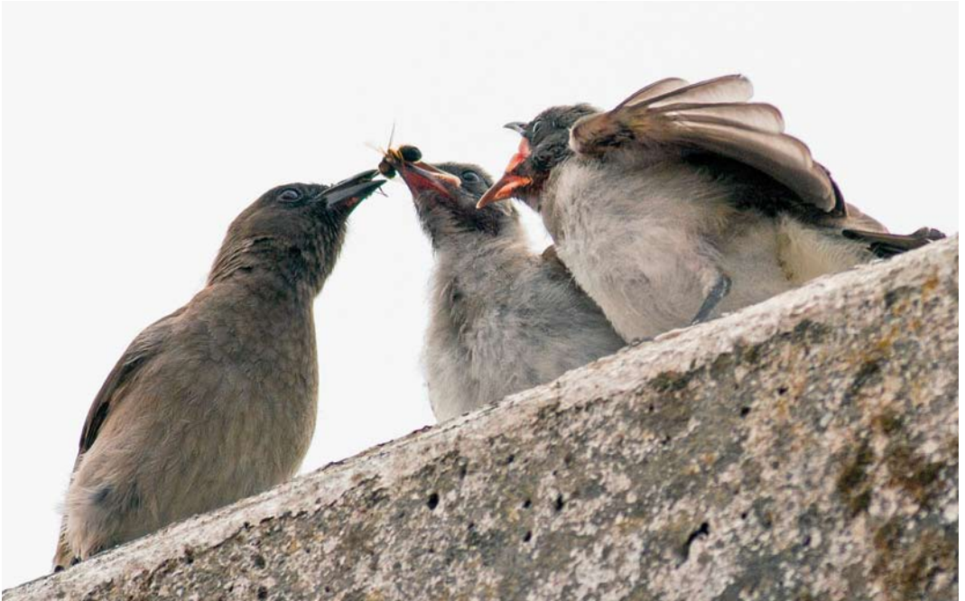
248 Common Bulbuls / Grauwe Buulbuuls Pycnonotus barbatus , adult and three young, Tarifa, Cádiz, Spain, 20 April 2014