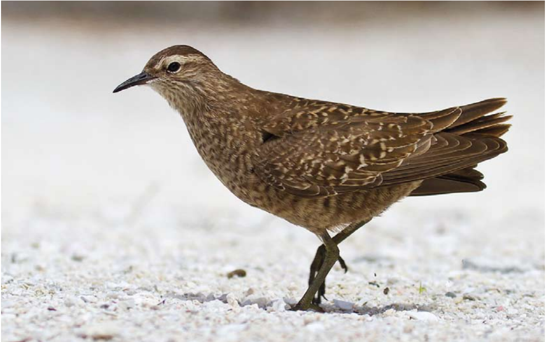
226 Tuamotu Sandpiper / Tuamotustrandloper Prosobonia parvirostris , dark morph, Morane Atoll, French Polynesia, 14 September 2013