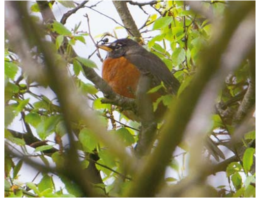
287 Roodborstlijster / American Robin Turdus migratorius , eerste-zomer mannetje, Noordhollands Duinreservaat, Heemskerk, Noord-Holland, 27 april 2014 (Jaap Denee)

dan een zuivere Azuurmees ligt er een zware bewijslast om Pleskes uit te sluiten (voor een compleet overzicht van gevallen van Azuurmees en Pleskes in Europa, zie Dutch Birding 34: 219-231, 2012). Op basis van de foto's en beschrijving lijken alle kenmerken te kloppen voor Azuurmees maar het verschil kan erg lastig zijn en daarom zal de Commissie Dwaalgasten Nederlandse Avifauna (CDNA) het definitieve oordeel moeten vellen. Indien aanvaard zou het de eerste Azuurmees voor Nederland betreffen. Er zijn wel drie gevallen van Pleskes (november 1968 en twee in november 2007).