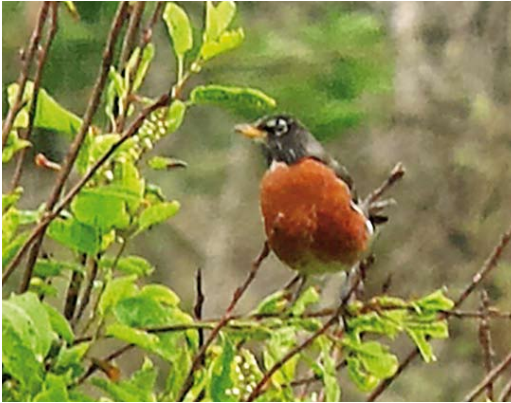
286 Roodborstlijster / American Robin Turdus migratorius , eerste-zomer mannetje, Noordhollands Duinreservaat, Heemskerk, Noord-Holland, 27 april 2014 (Lonnie Bregman)