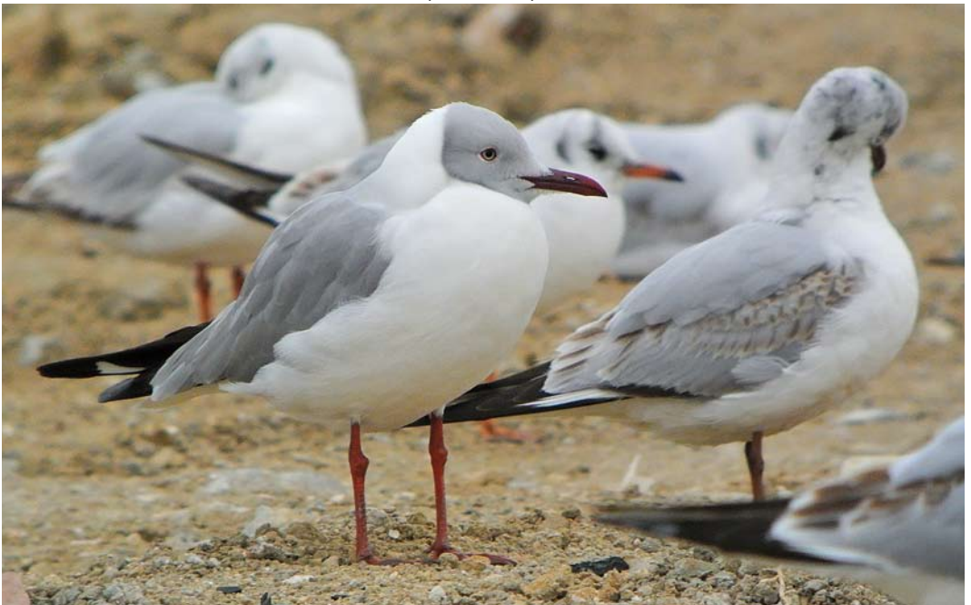
249 Grey-headed Gull / Grijskopmeeuw Chroicocephalus cirrocephalus , adult, with Black-headed Gulls / Kokmeeuwen C. ridibundus , Pinto dump, Madrid, Spain, 29 March 2014 ( Delfín González )