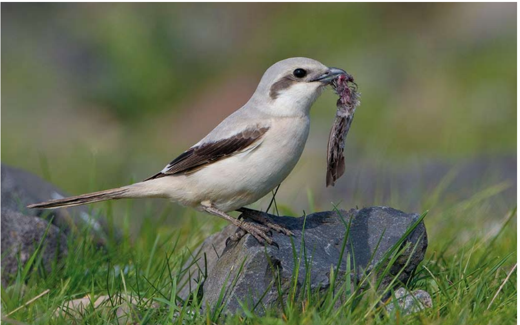
210 Steppeklapekster / Steppe Grey Shrike Lanius lahtora pallidirostris , Stuifdijk, Maasvlakte, Zuid-Holland, 1 mei 2014