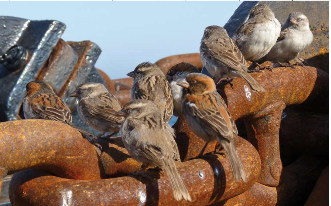
199 Iago Sparrows / Kaapverdische Mussen Passer iagoensis , on board of MV Plancius , Atlantic Ocean between Cape Verde Islands and Desertas, 8 May 2013. Note aberrantly coloured male right of centre.