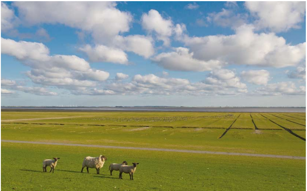
179 Breeding site of Gull-billed Terns Gelochelidon nilotica at Neufelderkoog, Schleswig-Holstein, Germany, 3 May 2014 (Sebastian Conradt)

In the Netherlands, Gull-billed Tern was an occasional breeder in the 20th century, the last breeding year being 1958 (at Harderwijk, Gelderland, and Swifterbant, Flevoland; van den Berg & Bosman 2001, Bijlsma et al 2001, van Dijk et al 2007). The most regular breeding site was nature reserve De Beer near Rotterdam, Zuid-Holland (destroyed in the 1960s by harbour expansions), where breeding occurred from the early 1930s to 1956 (van Oordt 1931, Strijbos 1931ab, Thijsse 1931, Kooijmans 1949, de Waard 1950ab, 1952; www.natuurmonumentdebeer.nl/vogels/vogels_lachstern.html ). It also bred in the 1940s at Wieringermeer, Noord-Holland (van Ijzendoorn 1948). Remarkably, a single pair did a breeding attempt at Balgzand, Noord-Holland, in 2005 but failed in the egg phase, possibly due to predation by Stoat Mustela erminea (van Dijk et al 2007; Ruud Vlek in litt). This area is the traditional post-breeding roosting area for birds from Denmark and Germany (see below).