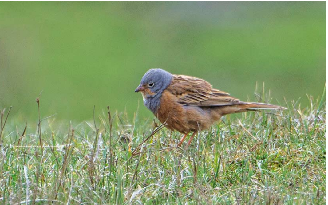
251 Cretzschmar's Bunting / Bruinkeelortolaan Emberiza caesia , male, Fair Isle, Shetland, Scotland, 2 May 2014