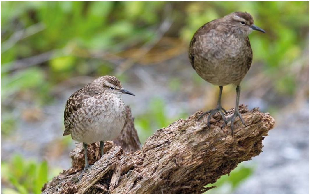
223 Tuamotu Sandpipers / Tuamotustrandlopers Prosobonia parvirostris , pale and dark morph, Tenararo Atoll, French Polynesia, 12 September 2013 (Steve N G Howell)

The species has at least three to four types of vocalizations (Miller et al 2003). Two types are only uttered by adult individuals and seemed to act as contact calls (Miller et al 2003). The third call type has been recorded for a family group and may have been uttered by juvenile birds (Miller et