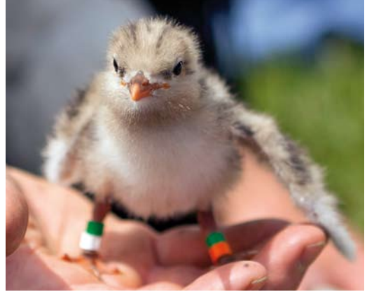
181 Gull-billed Tern / Lachstern Gelochelidon nilotica , chick ringed with colour-rings, Neufelderkoog, Schleswig-Holstein, Germany, 28 June 2012 (Sebastian Conradt)

koog-Vorland in Schleswig-Holstein. The c 40 breeding pairs prefer places grazed in spring by migrating Barnacle Goose Branta leucopsis . These short, open salt meadows are also traditionally grazed by sheep. The birds nest amidst c 2000 nests of Common Terns. The Gull-billed Terns are protected from intruders thanks to the aggressive behaviour of the Common Terns. In May, Gull-billed lay two to three eggs in a flat, bare scrape nest. After about three weeks the eggs hatch. The chicks fledge around mid-July. Usually, they start to breed when they are four to five years old (Bauer et al 2012). The breeding success in 1995-2012 strongly varied for each year but showed a strong overall decline (figure 3-4).