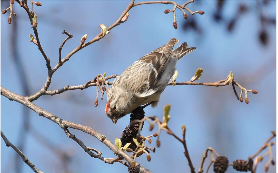
281 Witstuitbarmsijs / Coues's Arctic Redpoll Acanthis hornemanni exilipes , Het Twiske, Noord-Holland, 28 maart 2014 ( John van der Graaf ) 282 Witstaartkievit / White-tailed Lapwing Vanellus leucurus , De Nollen, Den Helder, Noord-Holland, 28 april 2014 ( Hans Brinks ) 283 Grijskopspecht / Grey-headed Woodpecker Picus canus , vrouwtje, Westplaat, Maasvlakte, Zuid-Holland, 31 maart 2014 ( Peter Soer )