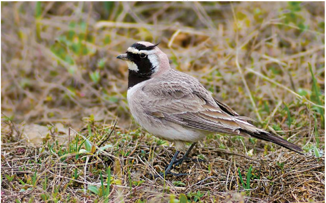
237 Caucasian Horned Lark / Kaukasische Strandleeuwerik Eremophila penicillata , Aragats, Armenia, 13 May 2011