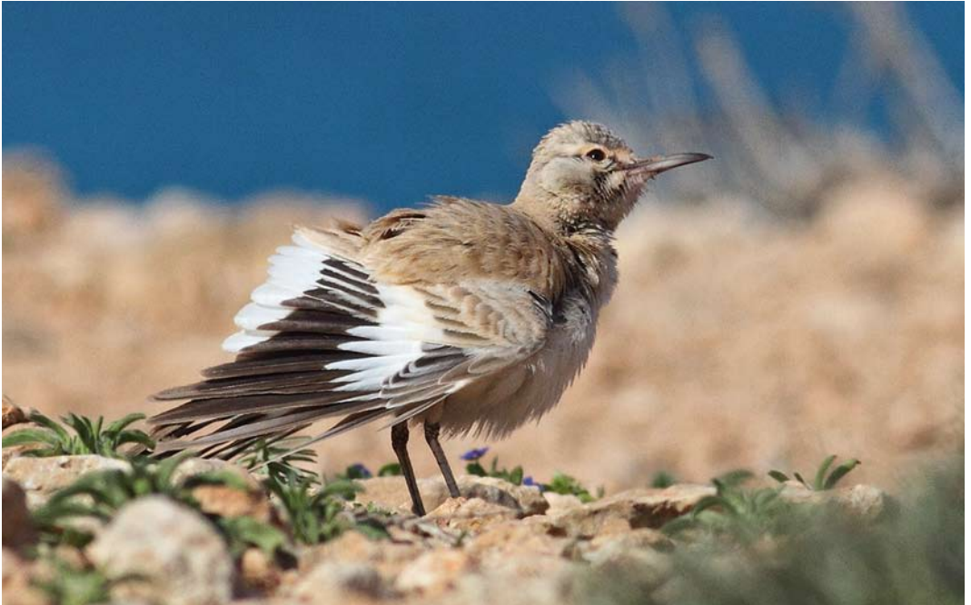
252 Greater Hoopoe-Lark / Witbandleeuwerik Alaemon alaudipes , Comino, Malta, 11 April 2014 (Natalino Fenech)