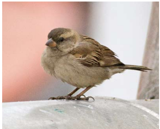
202 Iago Sparrows / Kaapverdische Mussen Passer iagoensis , female (left) and male, on board of MV Plancius , Hansweert, Zeeland, Netherlands, 20 May 2013 ( Cerjon Gelling ) 203 Iago Sparrows / Kaapverdische Mussen Passer iagoensis , male (left) and female, on board of MV Plancius , Hansweert, Zeeland, Netherlands, 20 May 2013 ( Luuk Punt ) 204 Iago Sparrow / Kaapverdische Mus Passer iagoensis , female, on board of MV Plancius , Hansweert, Zeeland, Netherlands, 20 May 2013 ( Karel Hoogteyling )

Hazevoet, C J 2013b. Iago sparrows in the Netherlands – a tragi-comical soap without happy ending. Website: www.scvz.org/info0913.html .