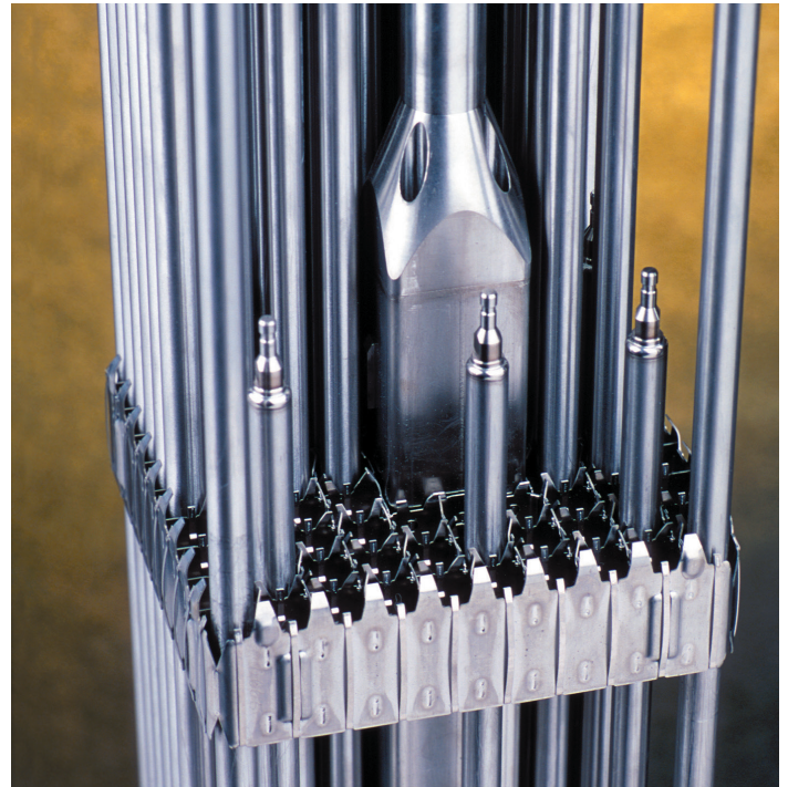
More than 27,000 ATRIUM 10 fuel assemblies have been used in 32 reactors since 1992.