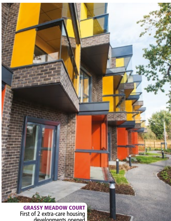
GRASSY MEADOW COURT First of 2 extra-care housing developments opened