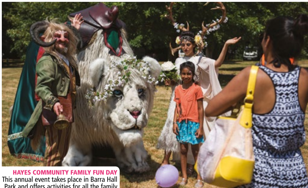
HAYES COMMUNITY FAMILY FUN DAY This annual event takes place in Barra Hall Park and offers activities for all the family