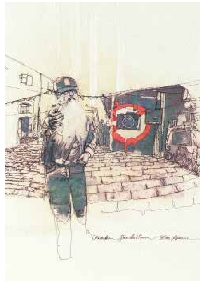
Previous page left to right: Please Don't Tell Tell Tell ; Stitchbed .