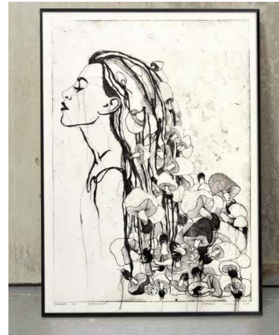
Clockwise from left: Dronning Louises Bro ; Hans Spot First ; Enthralled ; Arbejdsbillede .