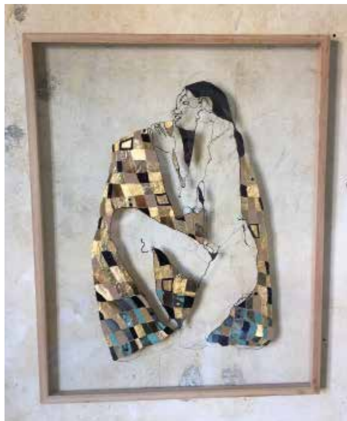
Left to right: Woman In Blanket - Inspired By Schiele; Havet Gir - Havet Tar; World of Disco.