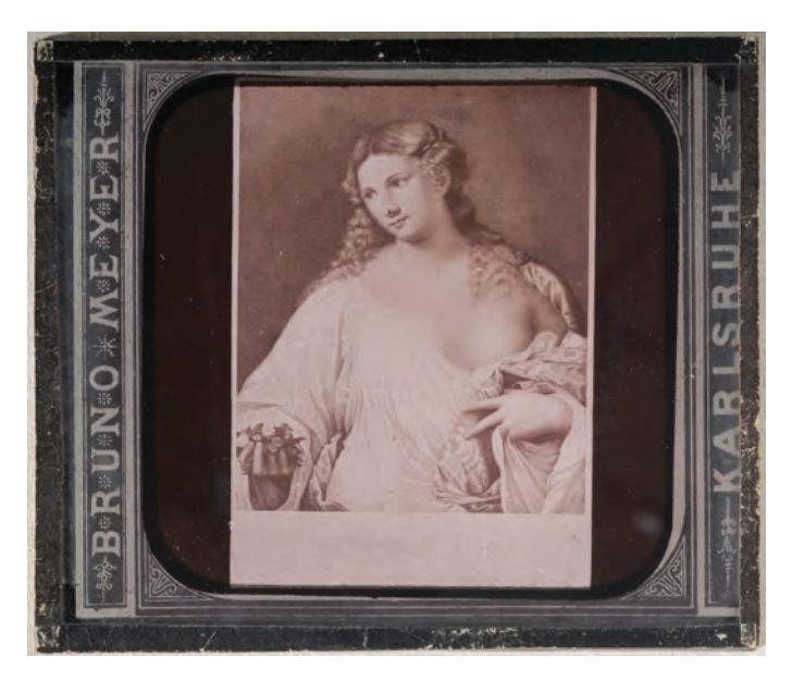
Fig. 2: Lantern slide photograph of Titian's Flora (1515–20), slide no. 3738, Bruno Meyer, c. 1883, carbon print on glass, 85 x 100 mm, KIT Archives, Karlsruhe, inv. no. 28002 sign. 872.

16. Bruno Meyer and the Invention of Art Historical Slide Projection