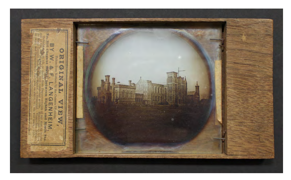
Fig. 1: Lantern slide photograph on glass in wood mount of Smithsonian Institution Building under construction, William Langenheim (1807–1874) and Frederick Langenheim (1809–1879) Philadelphia, 1850, Smithsonian Castle Collection, gift of Tom Rall, Arlington, Virginia, https://newsdesk.si.edu/photos/langenheim-lantern-slide, accessed August 14, 2018.

Victor<sup>4</sup> three years ago, in which positive prints are produced on glass (see Fig. 1). The quote from the Langenheims' catalog reads: