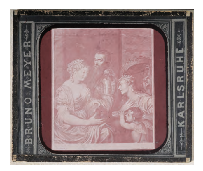
Fig. 4: Lantern slide photograph of Titian's Allegory of Marriage (c. 1530), slide no. 3725, Bruno Meyer, c. 1883, carbon print on glass, 85 x 100 mm, KIT Archives, Karlsruhe, inv. no. 28002 sign. 872.

In this context, Titian's Allegory of Marriage , now kept in the Louvre, can serve as a paradigmatic example (see Fig. 5). Etchings of the painting had been produced throughout the centuries, like that of Michael Natalis (see Fig. 6). It is this copperplate from the second half of the seventeenth century (see Fig. 7) that makes it into the ambitious index of glass slides of the art historian. This fact seems to echo Marshall McLuhan's idea of the old media becoming the content of the new media (McLuhan [1964] 2015, 19). It also may explain why the slides were quickly rendered obsolete, as reproduction processes were improving constantly. During the nineteenth century, the photograph was far from being seen as a substitute for the original piece of art, but it had to compete with older media. This reality of nineteenth-century reproductions becomes clearer by comparing Bruno Meyer and Herman Grimm, which I will do in the next section of this paper.