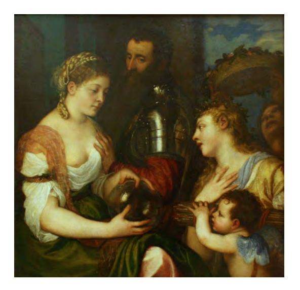
Fig. 5: Allegory of Marriage (Portrait of Alphonse d'Avalos, Marquis de Guast), Titian, c. 1530, oil on canvas, 123 x 107 cm, Louvre Paris, inv. no. 754.

16. Bruno Meyer and the Invention of Art Historical Slide Projection