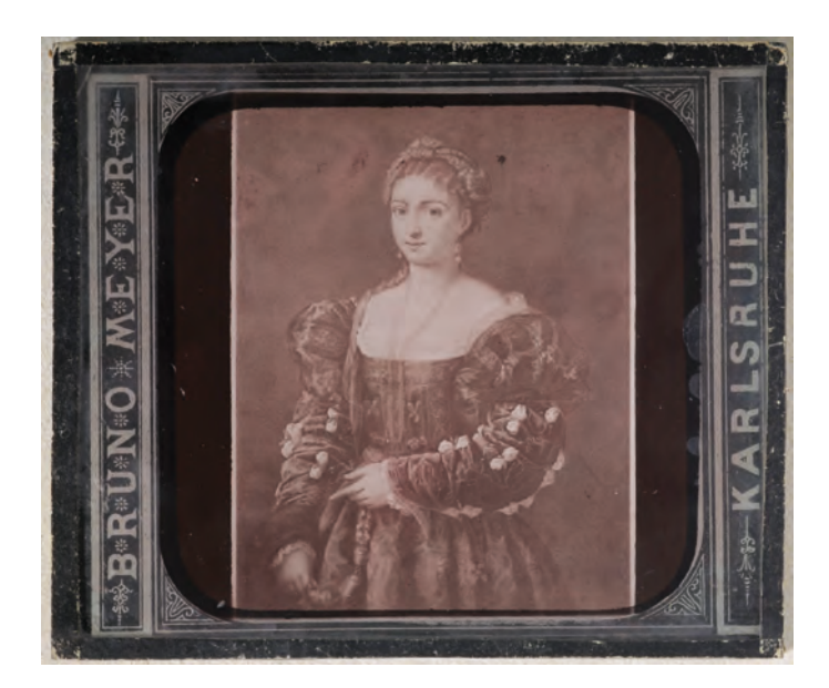
Fig. 3: Lantern slide photograph of Titian's La Bella (1536), Bruno Meyer, c. 1883, carbon print on glass, 85 x 100 mm, KIT Archives Karlsruhe, inv. no. 28002 sign. 872.

Fig. 2: Lantern slide photograph of Titian's Flora (1515–20), slide no. 3738, Bruno Meyer, c. 1883, carbon print on glass, 85 x 100 mm, KIT Archives, Karlsruhe, inv. no. 28002 sign. 872.