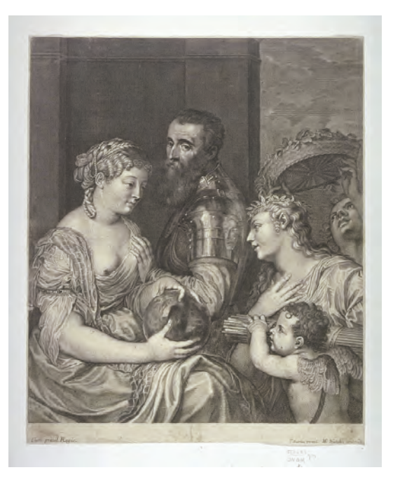
Fig. 6: Portrait of Alphonse d'Avalos, Marquis de Guast after Titian, Michael Natalis, seventeenth century, engraving/print, 32.2 x 26.8 cm (image), Fine Arts Museums of San Francisco.

Fig. 5: Allegory of Marriage (Portrait of Alphonse d'Avalos, Marquis de Guast), Titian, c. 1530, oil on canvas, 123 x 107 cm, Louvre Paris, inv. no. 754.