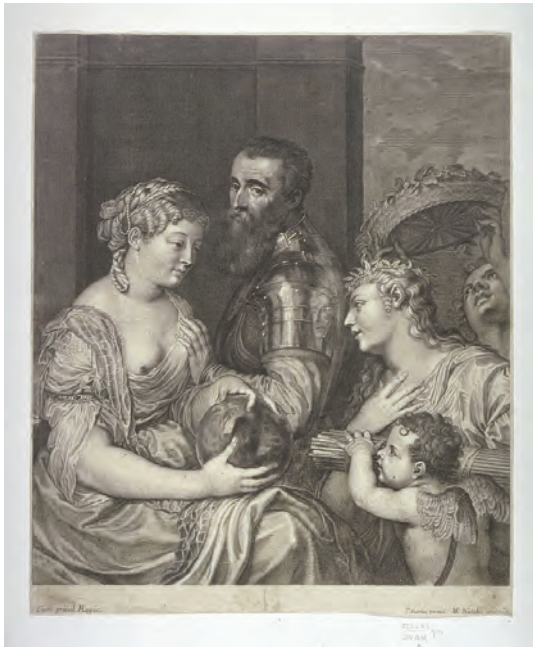
Fig. 6: Portrait of Alphonse d'Avalos, Marquis de Guast after Titian, Michael Natalis, seventeenth century, engraving/print, 32.2 x 26.8 cm (image), Fine Arts Museums of San Francisco.