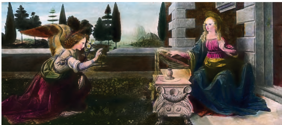
Fig. 8: Hand-colored lantern slide photograph, Leonardo da Vinci's Annunciation , Department of Art History and Musicology, Johannes Gutenberg University, Mainz.