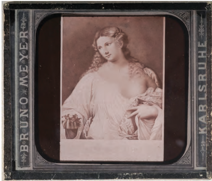
Fig. 2: Lantern slide photograph of Titian's Flora (1515–20), slide no. 3738, Bruno Meyer, c. 1883, carbon print on glass, 85 x 100 mm, KIT Archives, Karlsruhe, inv. no. 28002 sign. 872.