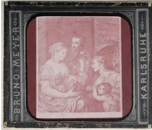
Fig. 4: Lantern slide photograph of Titian's Allegory of Marriage (c. 1530), slide no. 3725, Bruno Meyer, c. 1883, carbon print on glass, 85 x 100 mm, KIT Archives, Karlsruhe, inv. no. 28002 sign. 872.

In this context, Titian's Allegory of Marriage , now kept in the Louvre, can serve as a paradigmatic example (see Fig. 5). Etchings of the painting had been produced throughout the centuries, like that of Michael Natalis (see Fig. 6). It is this copperplate from the second half of the seventeenth century (see Fig. 7) that makes it into the ambitious index of glass slides of the art historian. This fact seems to echo Marshall McLuhan's idea of the old media becoming the content of the new media (McLuhan [1964] 2015, 19). It also may explain why the slides were quickly rendered obsolete, as reproduction processes were improving constantly. During the nineteenth century, the photograph was far from being seen as a substitute for the original piece of art, but it had to compete with older media. This reality of nineteenth-century reproductions becomes clearer by comparing Bruno Meyer and Herman Grimm, which I will do in the next section of this paper.