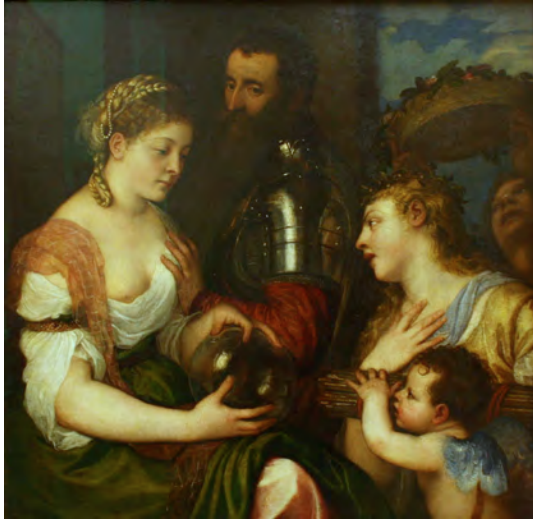
Fig. 5: Allegory of Marriage (Portrait of Alphonse d'Avalos, Marquis de Guast), Titian, c. 1530, oil on canvas, 123 x 107 cm, Louvre Paris, inv. no. 754.