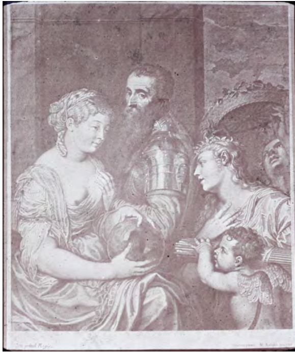
Fig. 7: Detail of lantern slide photograph of Titian's Allegory of Marriage (c. 1530), slide no. 3725, Bruno Meyer, c. 1883, carbon print on glass, 85 x 100 mm, KIT Archives, Karlsruhe, inv. no. 28002 sign. 872.

What we do know is that a few years later Berlin became a hotspot for slide projection. Art historiography accordingly places the Berliner Herman Grimm (cf. Rößler 2010) in the role of the successful promoter and the Karlsruher Bruno Meyer in that of the failed inventor (Dilly 1995), but I would argue that it is not that straightforward. Although it may be true that Herman Grimm (1897), who published a quite influential manifesto on slide projection, 16 was indeed an important protagonist, further research would be necessary to be certain exactly what kind of influence Meyer had on Grimm.