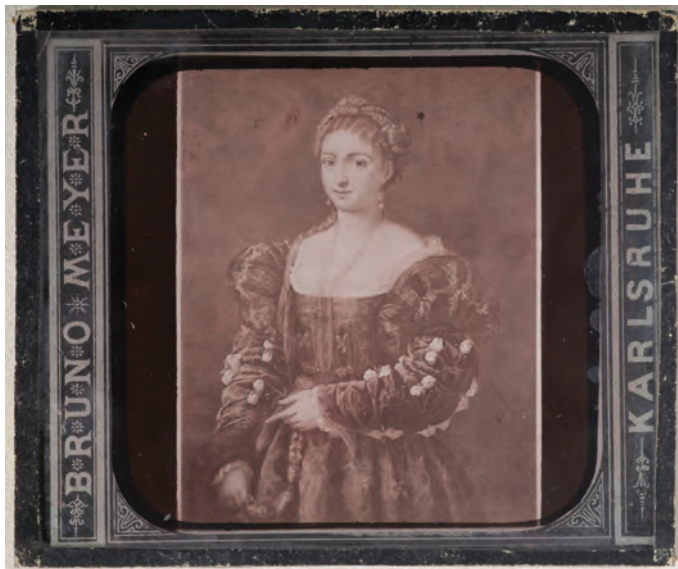
Fig. 3: Lantern slide photograph of Titian's La Bella (1536), Bruno Meyer, c. 1883, carbon print on glass, 85 x 100 mm, KIT Archives Karlsruhe, inv. no. 28002 sign. 872.