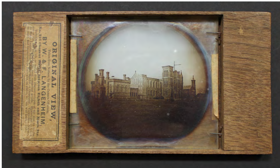
Fig. 1: Lantern slide photograph on glass in wood mount of Smithsonian Institution Building under construction, William Langenheim (1807–1874) and Frederick Langenheim (1809–1879) Philadelphia, 1850, Smithsonian Castle Collection, gift of Tom Rall, Arlington, Virginia, https://newsdesk.si.edu/photos/langenheim-lantern-slide , accessed August 14, 2018.

Victor 4 three years ago, in which positive prints are produced on glass (see Fig. 1). The quote from the Langenheims' catalog reads: