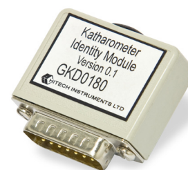
Figure 2 - KIM

Each sensor assembly is supplied with a Katharometer Identity Module (KIM) - see Figure 2. The KIM attaches to the analyser electronics and uniquely identifies the sensor and its calibration curves. This enables fast replacements to be made with no need for extended analyser downtime or lengthy calibration procedures.