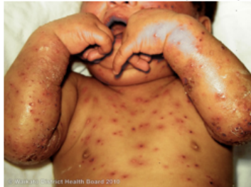
Varicella Zoster Virus (HHV3)