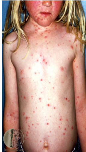
Exanthem (Ex. Varicella)