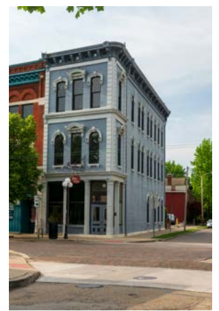
from the wall.

cornice, around windows, and dividing the floors. The building was originally painted with a Victorian paint scheme.