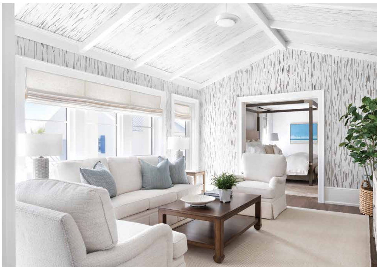
Stylized pecky cypress walls wrap around the master sitting room, where an inviting sitting area facing a wide-screen television beckons. Additional texture is seen in the carpeting and window treatments.

provides a postcard-perfect view of the courtyard, where a pool, patio, fire pit and come-join-in-the-fun chaise lounges beckon. A rubber tree, too magnificent to be believed, and a border of native plantings provide privacy.