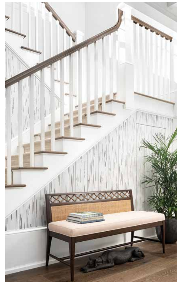
Marion grew up in a house with pecky cypress, and her fondness for the reclaimed lumber prompted an updated version in the entry hall.

brushed with subtle shades of sand and sky blue, provides the perfect background.