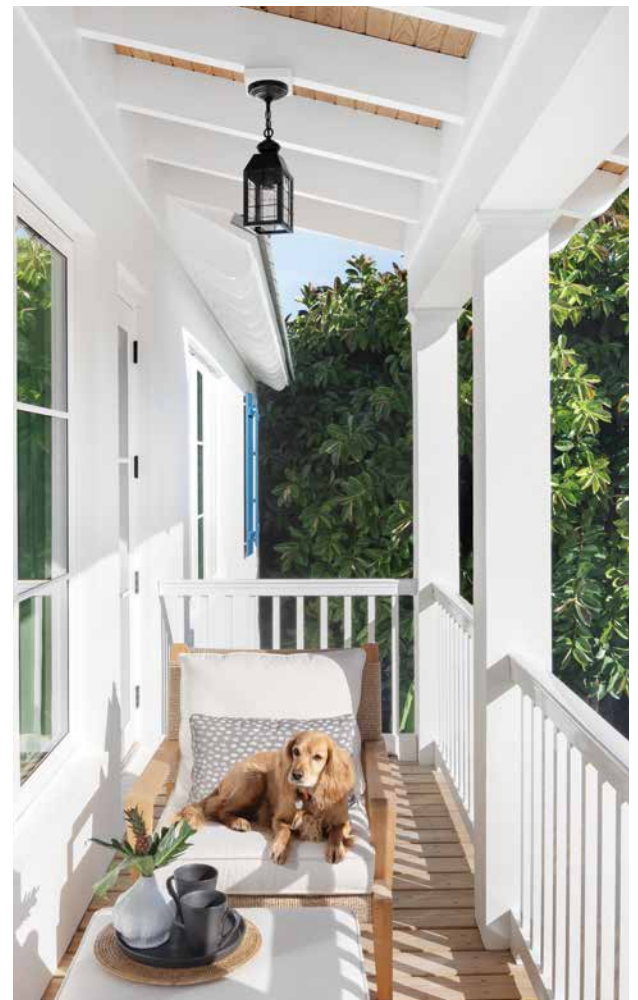
Spyker, the de Vogel’s English cocker spaniel is catching some sun on the second floor balcony off the master sitting room. Dixon the lab can’t be too far away, as the dogs are inseparable.

“Willem and I loved the weather and all the light here.”