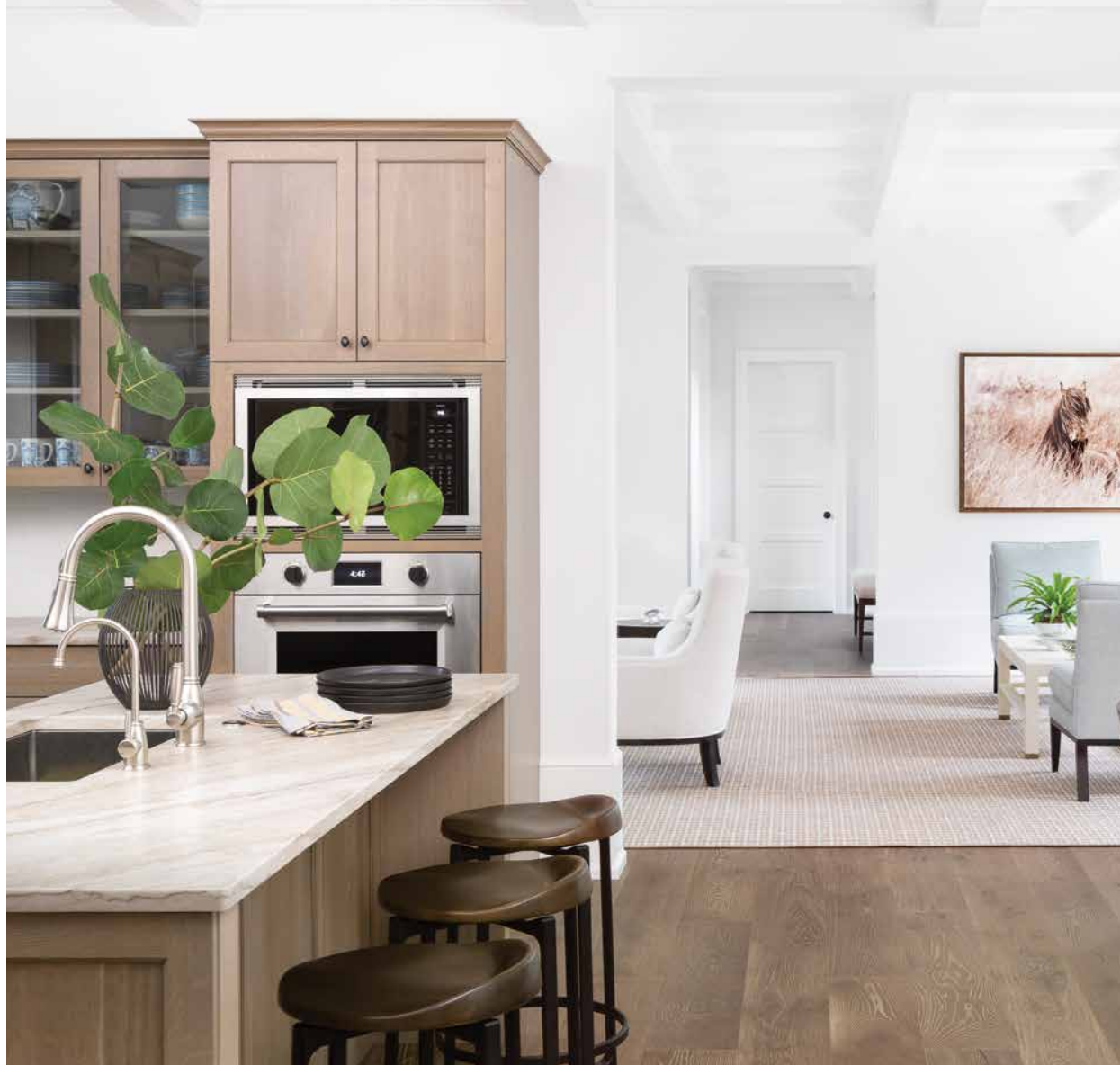
In the kitchen, Marion chose honed granite for the countertops; the island top reminded her of an uneven wave breaking on the sand. Behind glass-front cabinets, blue-and-white pottery and glassware continue the seaside theme.

oceanside enclave, surrounded by a native landscape buffer, would have nine residences, all on the south side of the lane, and all designed by Moulton Layne PL.