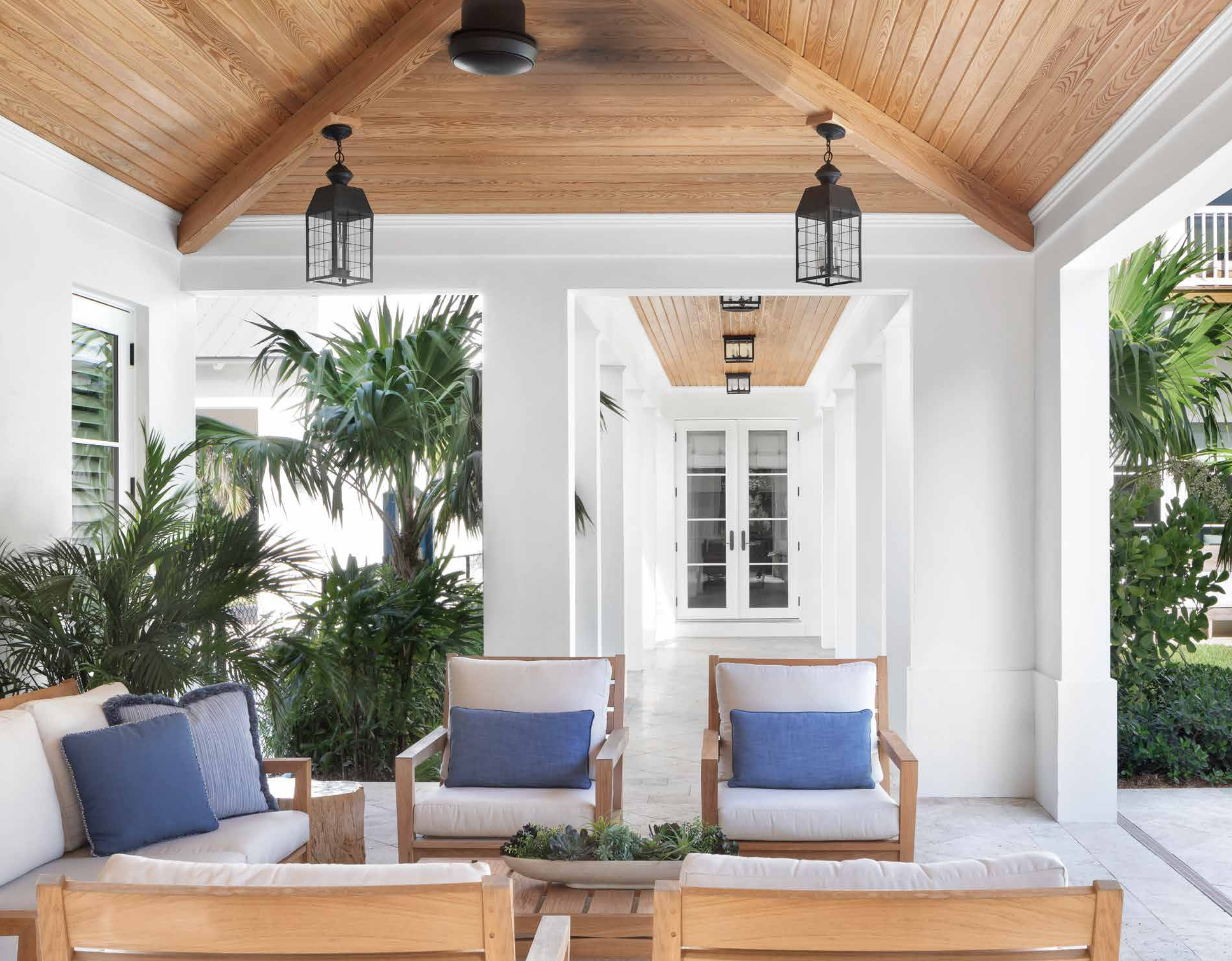
Marion continued the blue-and-white theme when selecting outdoor furnishings, both on the covered loggia and by the pool, where sapphire glass tiles sparkle and bath towels of the same shade await.