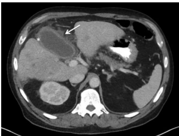
Fig. 2 Axial contrast material-enhanced computed tomography scan that shows gallbladder wall thickening (white asterisk) with adjacent inflammatory changes (white arrow). No radiodense stones are present, consistent with acalculous cholecystitis.

Cholecystectomy has been regarded as the gold standard treatment for AC. With the advent of laparoscopic cholecystectomy, early surgery is considered safe and cost-effective for the management of AC with complication rates of < 1%. 8,9 Optimal management of AC in the elderly or criti-