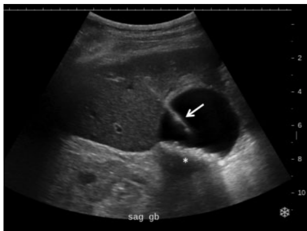
Fig. 3 Ultrasound-guided cholecystostomy with an 8-French drainage catheter (white arrow) placed into the gallbladder using the trocar technique (same patient with ► Fig. 1 ). White asterisk indicates posterior acoustic shadowing from gallstones.

portal vessel injury, and displacement of the catheter after decompression of the gallbladder as the decompressed gallbladder retracts away from the catheter tip. 23 The methods for PC catheter placements include the Seldinger's technique and the Trocar technique. 24