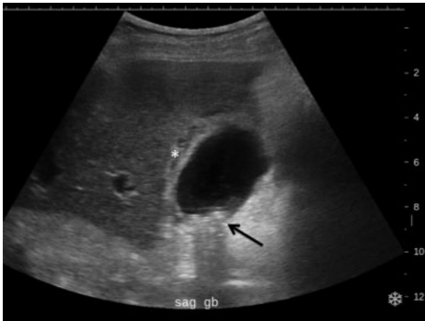
Fig. 1 Ultrasound image demonstrated gallbladder wall thickening (white asterisk) and gallstones (black arrow) consistent with acute calculous cholecystitis. Clinically, patient had a positive sonographic Murphy's sign.

scenario of an intubated, sedated patient in the intensive care unit. By the time the diagnosis has been made, at least half of the patients experience a cholecystitis-related complication such as gangrene or a confined perforation of the gallbladder. 5 The mortality rate of acute AC is high, ranging from 10 to 50%, compared with a 1% mortality rate in patients with calculous cholecystitis. 6,7 Since AC may present with a spectrum of disease stages ranging from a mild self-limited illness to a fulminant potentially life-threatening illness, appropriate management based on appropriate severity assessment is necessary for improved prognosis.