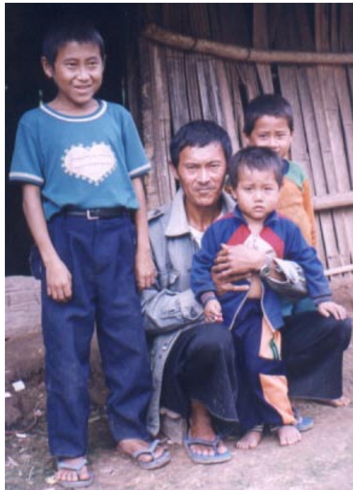
Ethnic highland villagers of all generations agree to combat illicit drug use.

lish the priority of socio-economic needs with the highland communities. Drug abuse in the highlands could not be addressed in isolation; therefore, data was collected and major themes were identified including: income and food security, clean water, health care, sanitation, access to credit, roads to market, and electricity.