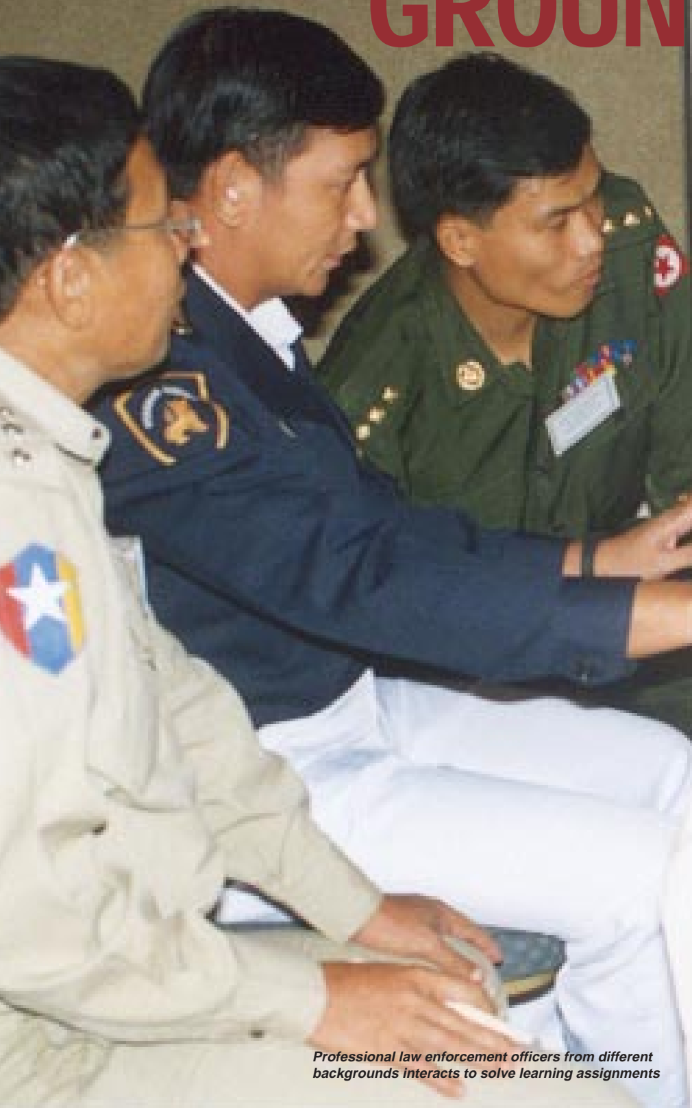
Professional law enforcement officers from different backgrounds interact to solve learning assignments

The UNDCP Regional Centre in Bangkok is delivering training to the drug law enforcement community in 6 countries in East Asia; however, it is training with a difference. Front line staff are being taught knowledge and skills in a whole range of drug related topics through computer based training. This project is the first of its kind in the drug law enforcement field. It should be regarded as a model, a means of establishing the best practice for other agencies to follow.