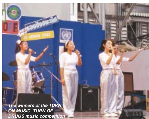
The winners of the TURN ON MUSIC, TURN OFF DRUGS music competition

ing and performance skills and integrate anti-drug messages into their music and performance. A joint press conference on the competition was launched to attract the media and the public to the event. In addition, anti-drug messages and interviews were also broadcast by various radio and TV channels.