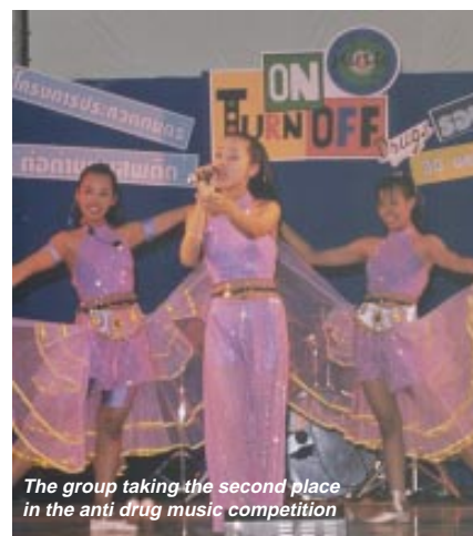
The group taking the second place in the anti drug music competition

Over 200 schools and colleges from Bangkok and the provinces entered the competition and submitted their recorded tapes to the organizers. After two rounds of screening, 10 outstanding teams were chosen by the Selection Committee to participate in the final competition. Prior to the final contest, a three-day Music Camp/Workshop was organized from the 21-23 of January at the UN Convention Centre and ONCB to further train these selected students on sing-