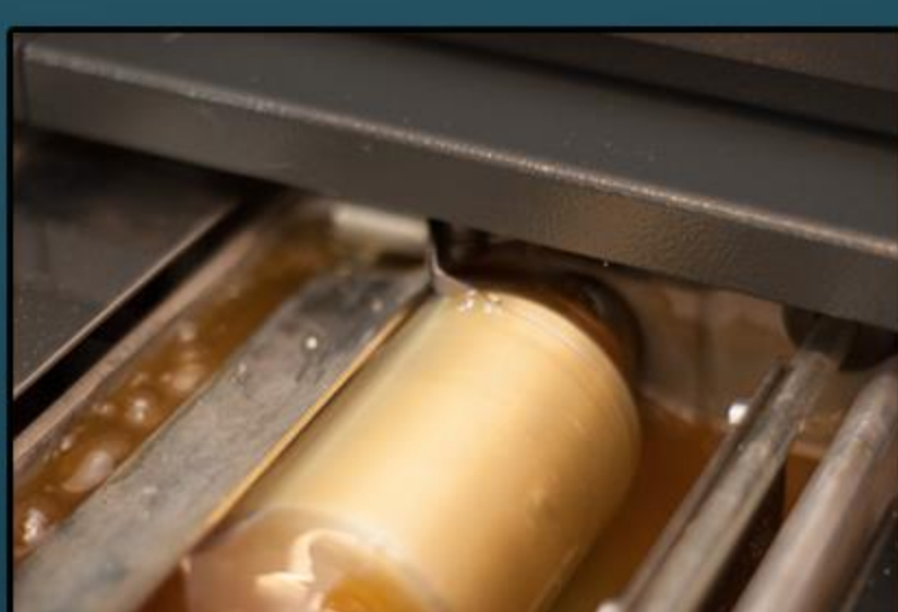
Standard Glue Tank