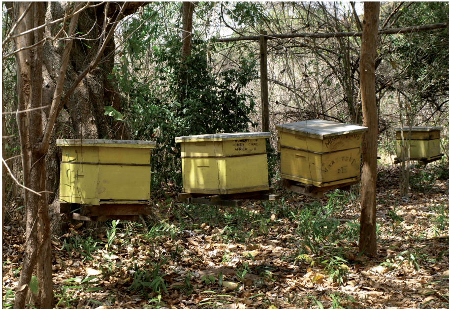
Fig. 5: Langstroth hives in the forest, Kilifi district.