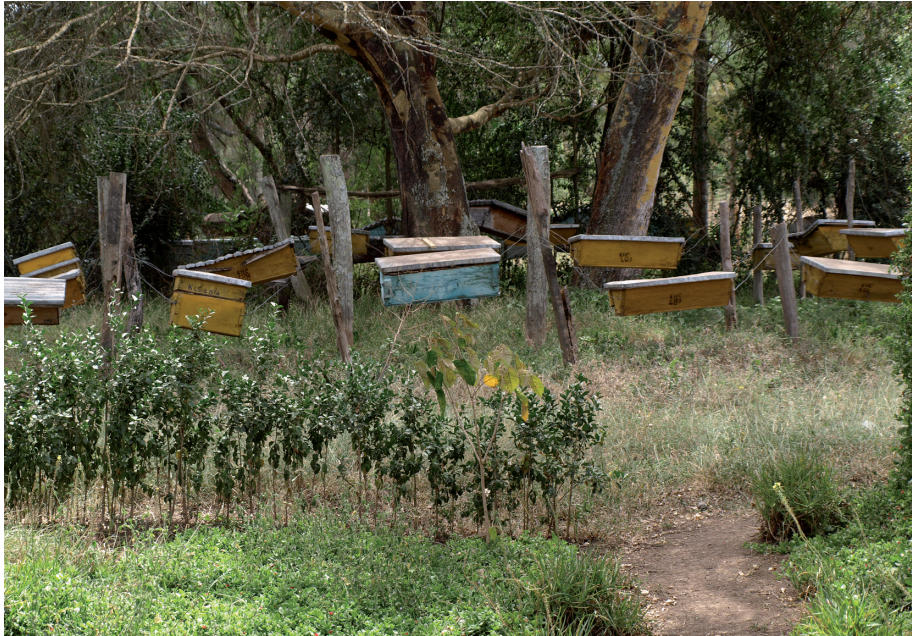
Fig. 3: Kenya top bar hive (KTBH), Laikipia district (Photo: J. SCHLIESKE).

Abb. 3: Kenianische Oberträgerbeute, Laikipia district (Foto: J. SCHLIESKE).