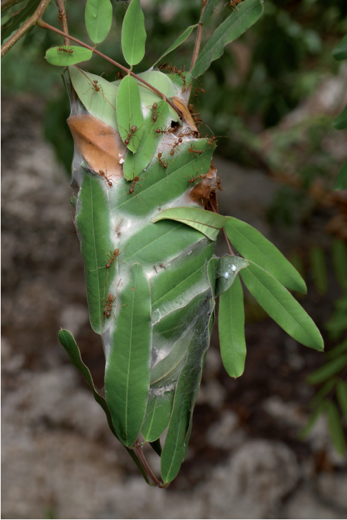
Fig. 12: Nest of the Tailor ant Oecophylla longinoda (Photo: J. SCHLIESKE).

Abb. 12: Nest der Weberameise Oecophylla longinoda (Foto: J. SCHLIESKE).