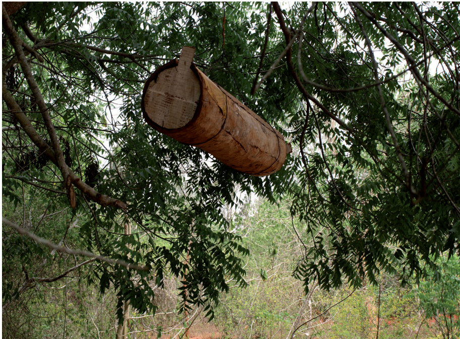
Fig. 2: Traditional log hive in detail, Kilifi district.