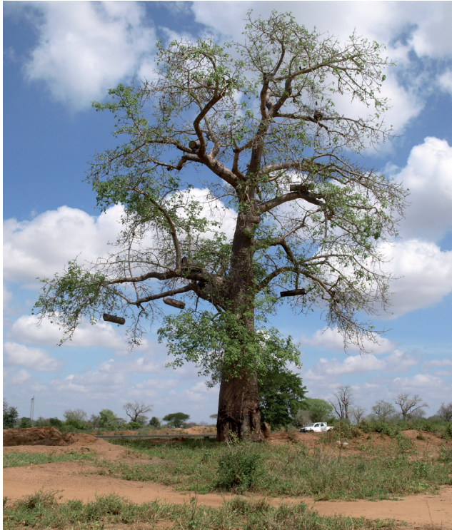
Fig. 1: Traditional log hives in a Baobab tree, Makueni district.