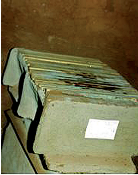
Fig. 7: Soil block hive placed in the hut.

Abb. 7: Lehmbeute in einer Hütte.