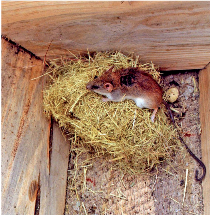
Fig. 9: The dormouse Graphiurus murinus on its nest inside a hive.

Abb. 9: Die Haselmaus Graphiurus murinus auf ihrem Nest in einer Beute.