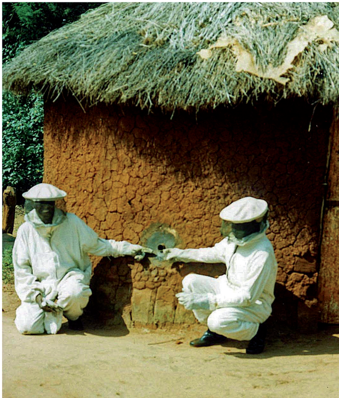
Fig. 6: A hut in a village with a bee entrance to inside deposited soil block hives.