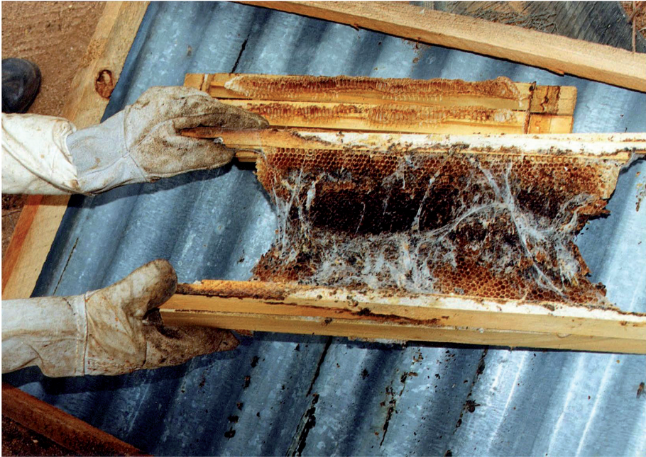
Fig. 10: Two wax combs held together by wax moth webbing