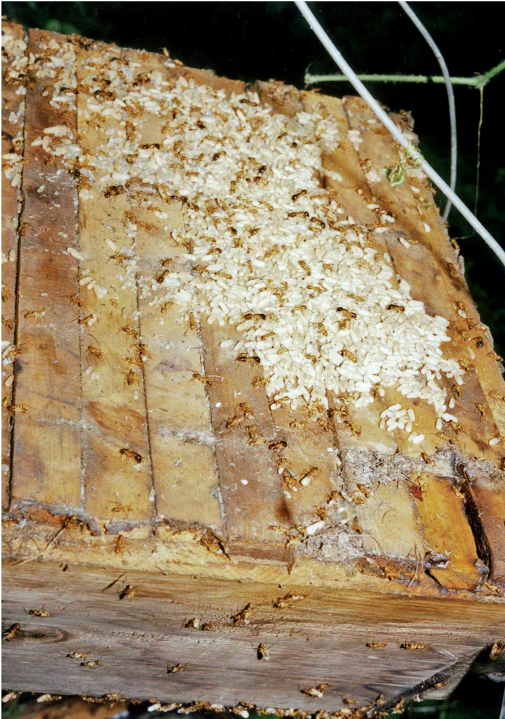
Fig. 13: Adults and pupae of the Larger sugar ant Camponotus maculatus on the top bars of a hive.

Abb. 12: Nest der Weberameise Oecophylla longinoda.