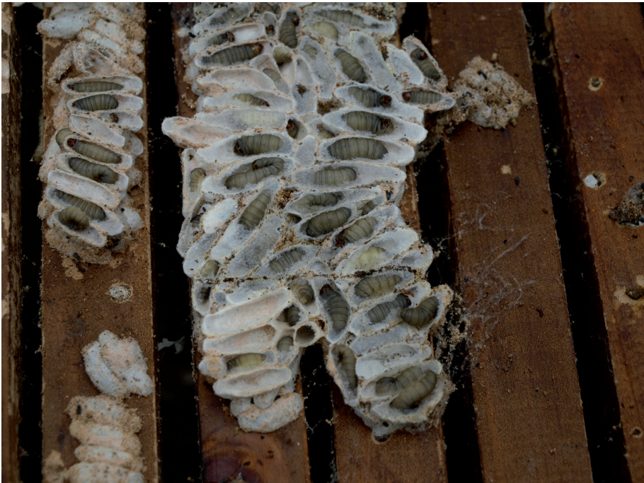
Fig. 11: Full grown larvae of the Greater wax moth ready for pupation