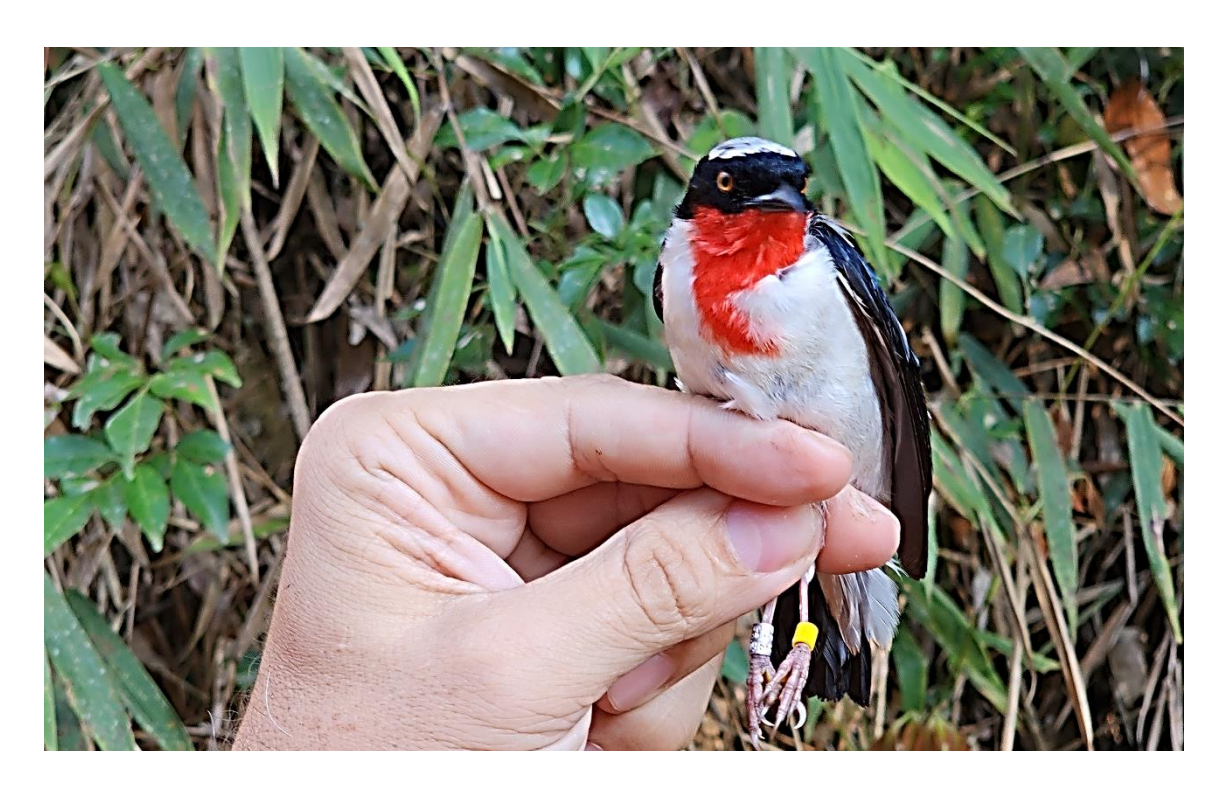
ZGAP - Zoologische Gesellschaft für Arten- und Populationsschutz e.V.