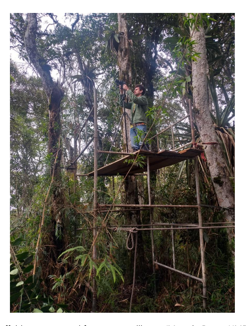
Fig. 3 - Scaffold structure used for nest surveillance.

All biological data collected is under analysis and will be reported in a scientific paper to be submitted to publication in 2023.