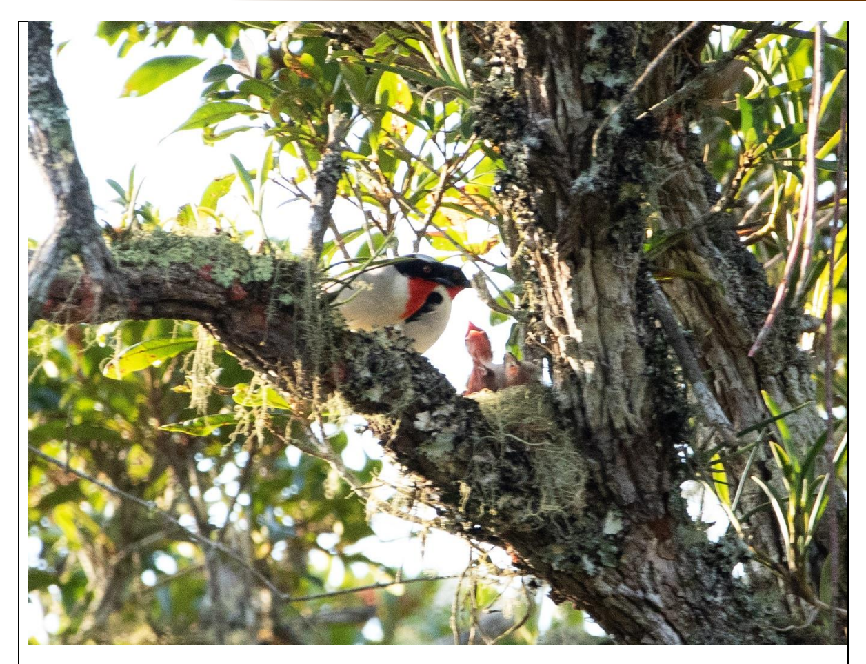
Fig. 4 - Cherry Throated Tanager nest monitored at Reserva Kaetés.